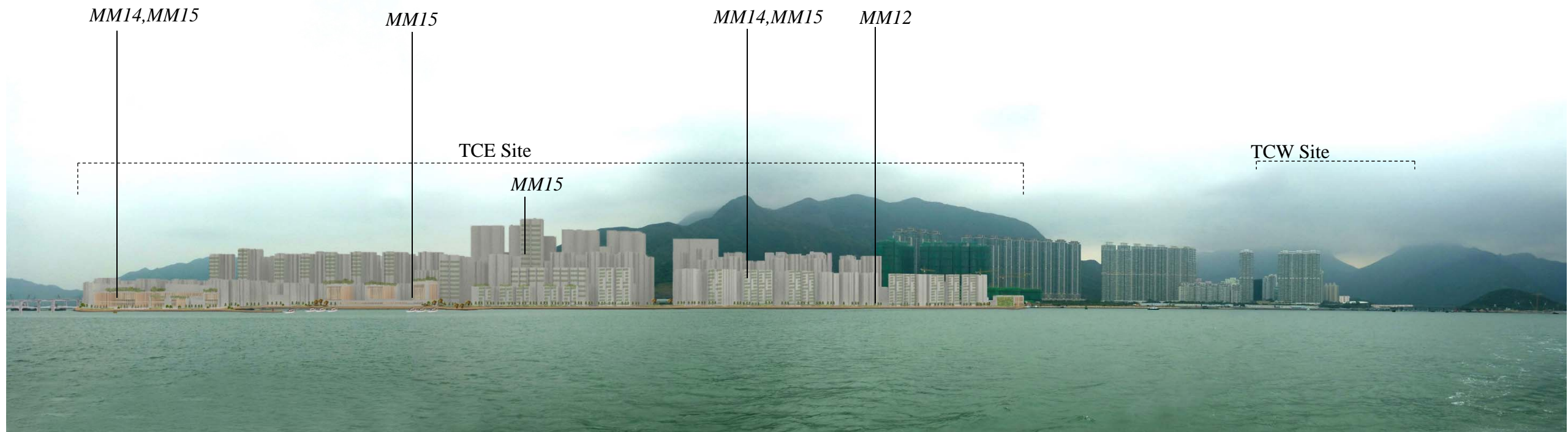
VSR 43 Photomontage- with mitigation at Day 1