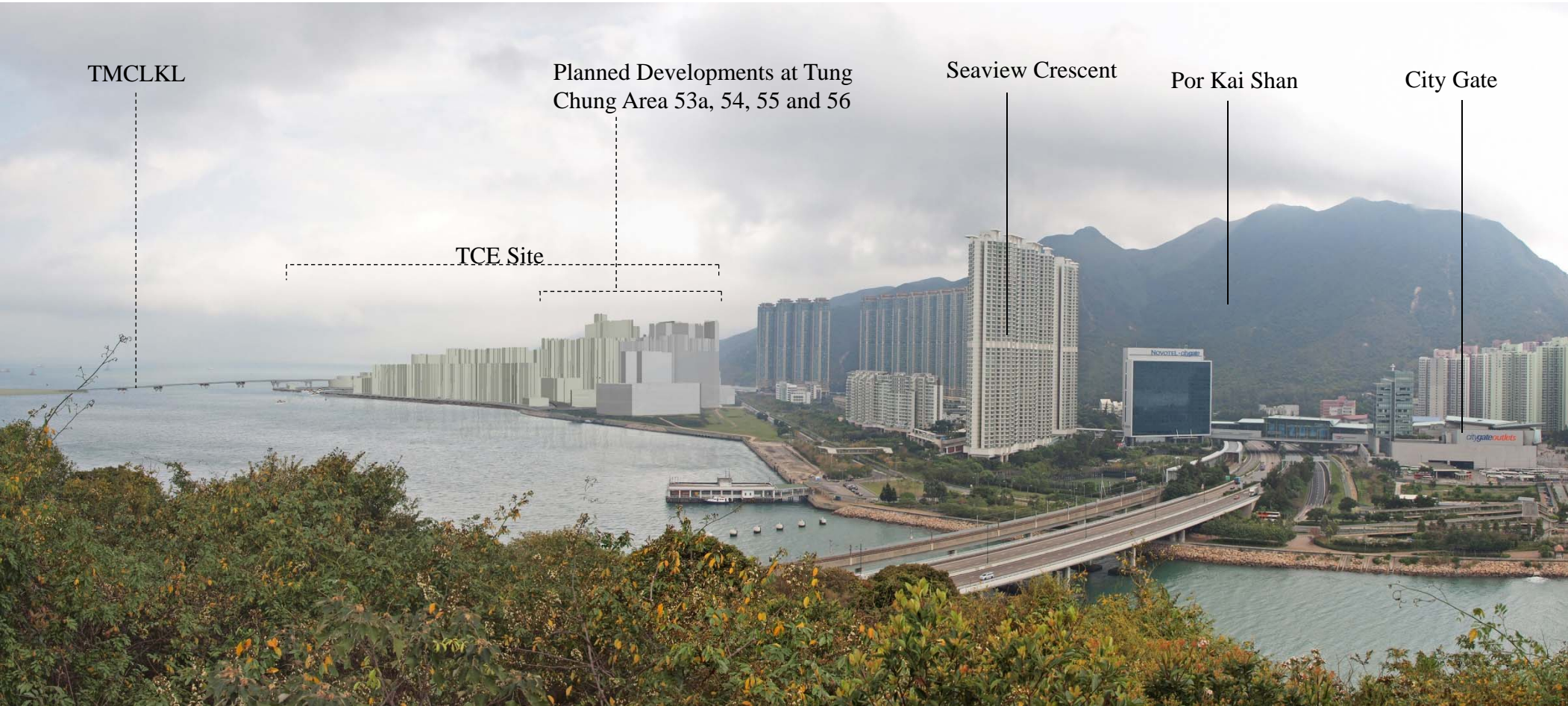
VSR 5 Photomontage- no mitigation at Day 1

Note: 1. The photomontages have been generated to provide a preliminary idea on the scale and extent of the proposed development. These images will be subject to change and are for illustrative purposes only. Built form demonstrates scale and massing only, it does not represent architectural design, finishes or any other related detailed design components.