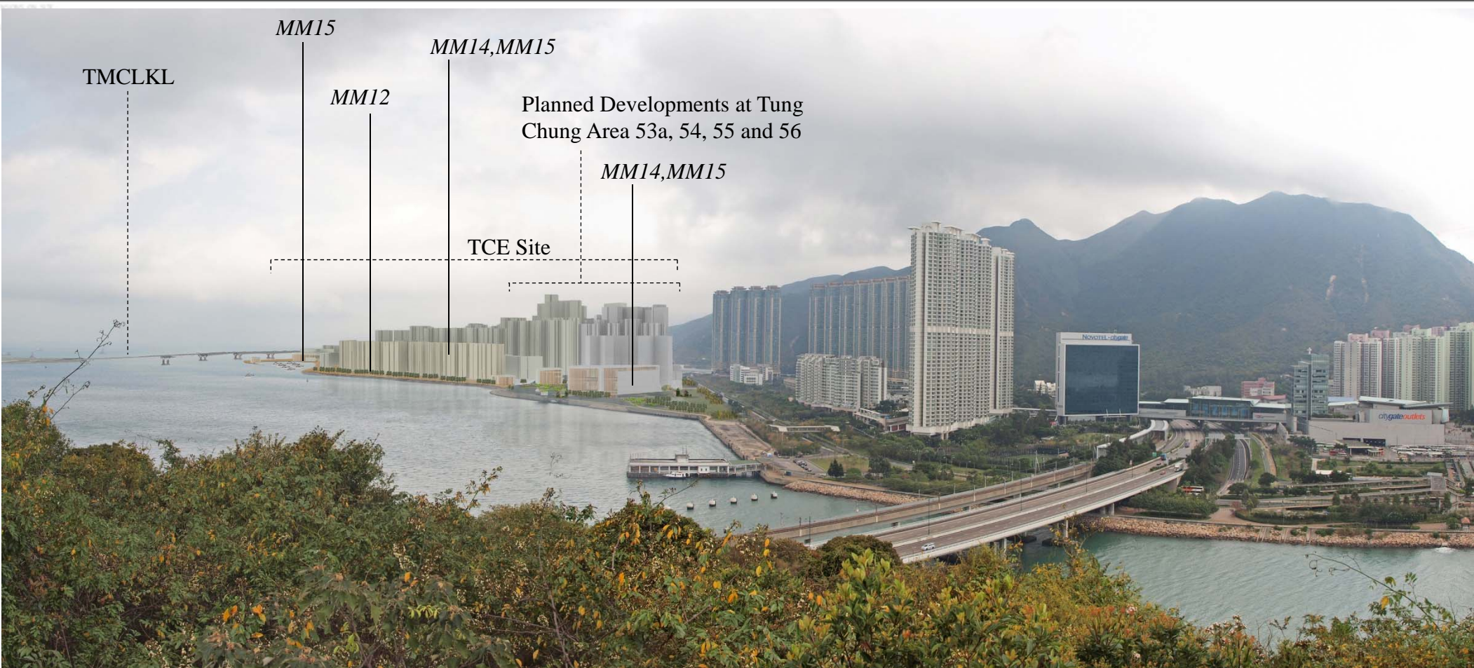
VSR 5 Photomontage- with mitigation at Day 1