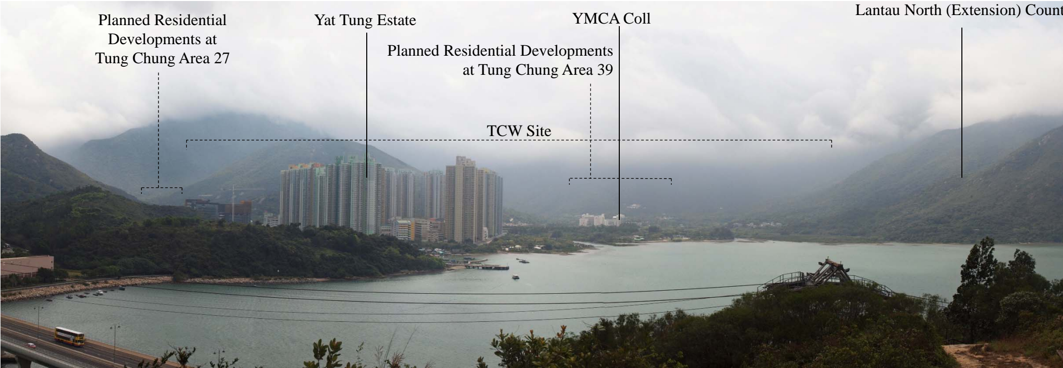
VSR6 Existing View

Note: 1. The photomontages have been generated to provide a preliminary idea on the scale and extent of the proposed development. These images will be subject to change and are for illustrative purposes only. Built form demonstrates scale and massing only, it does not represent architectural design, finishes or any other related detailed design components.