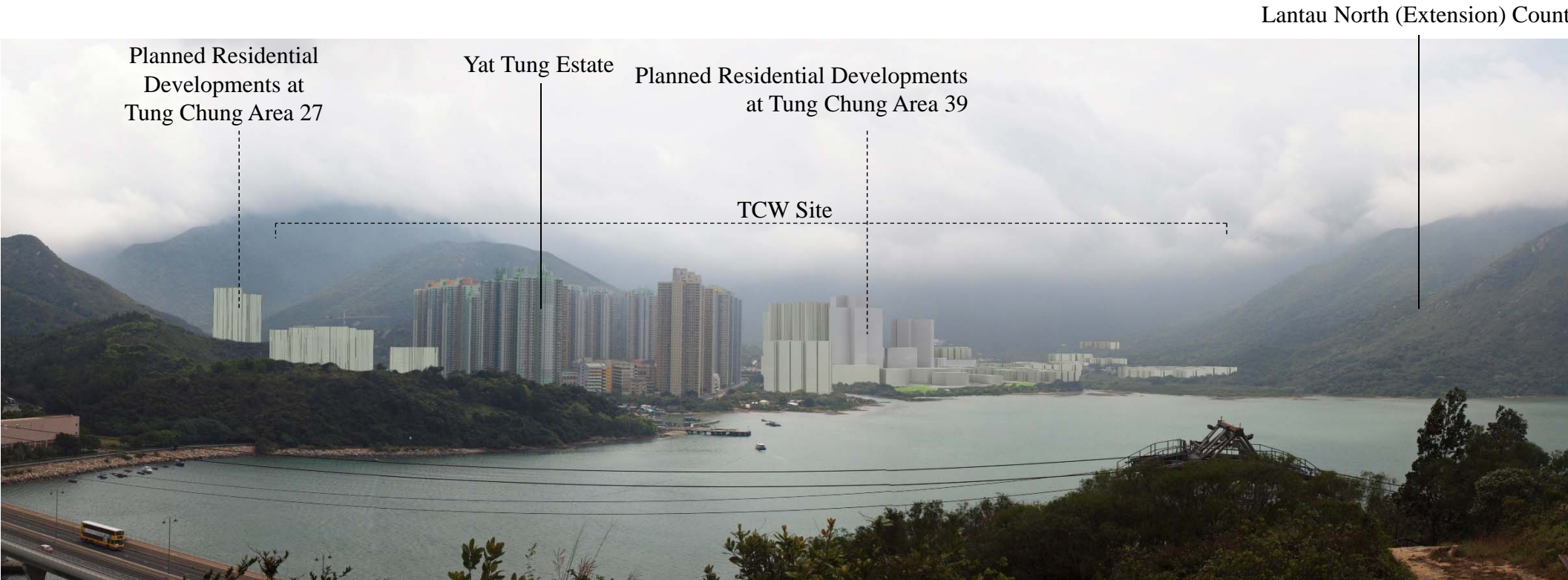
VSR 6 Photomontage- no mitigation at Day 1