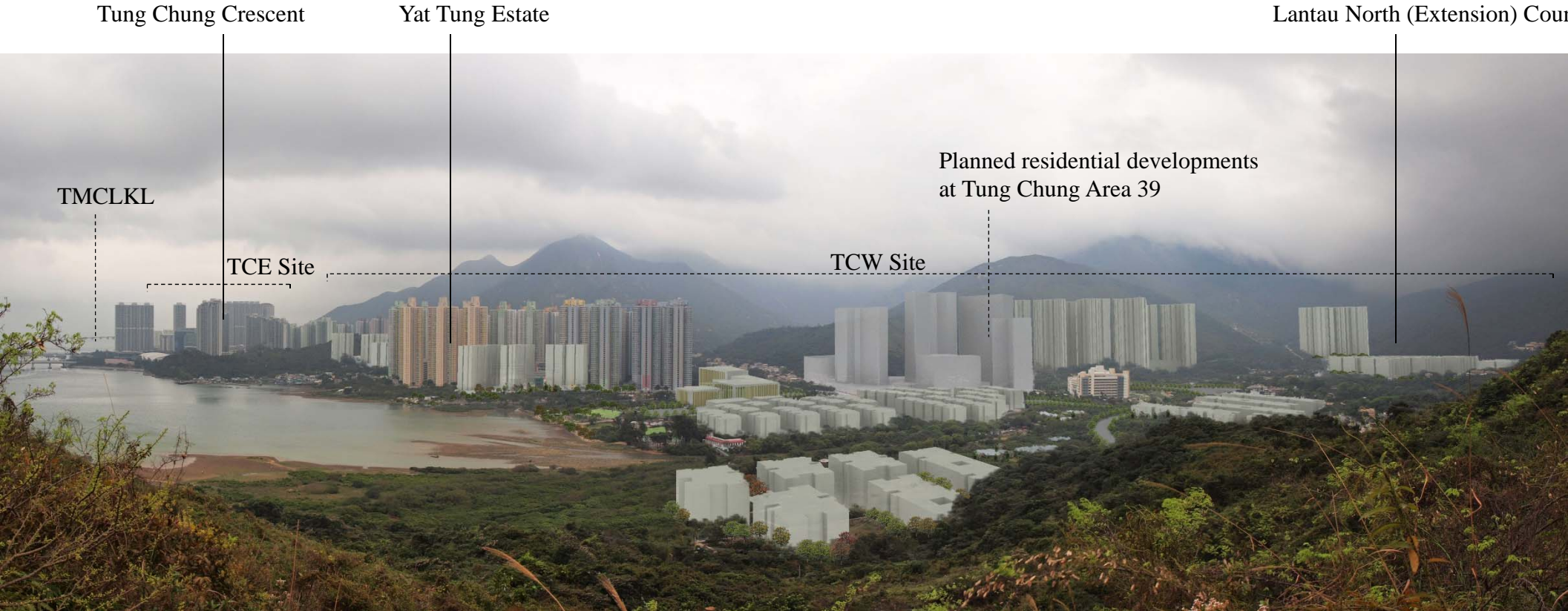
VSR 20 Photomontage- no mitigation at Day 1

Note: 1. The photomontages have been generated to provide a preliminary idea on the scale and extent of the proposed development. These images will be subject to change and are for illustrative purposes only. Built form demonstrates scale and massing only, it does not represent architectural design, finishes or any other related detailed design components.