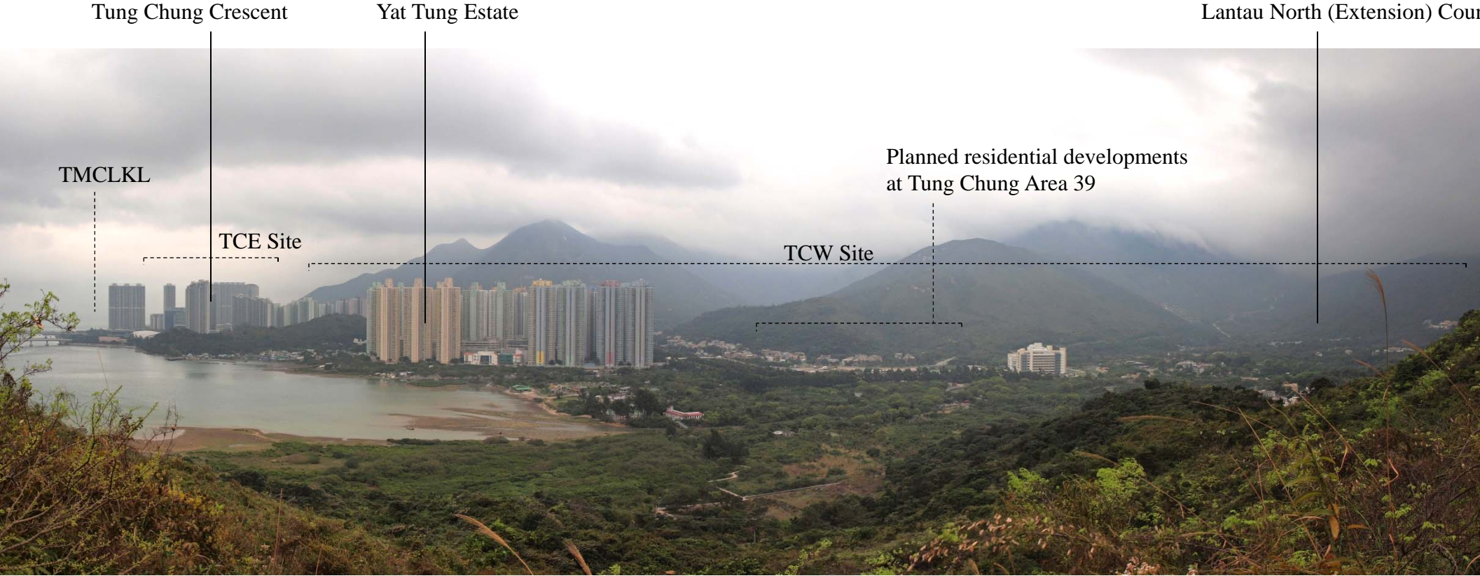
VSR20 Existing View