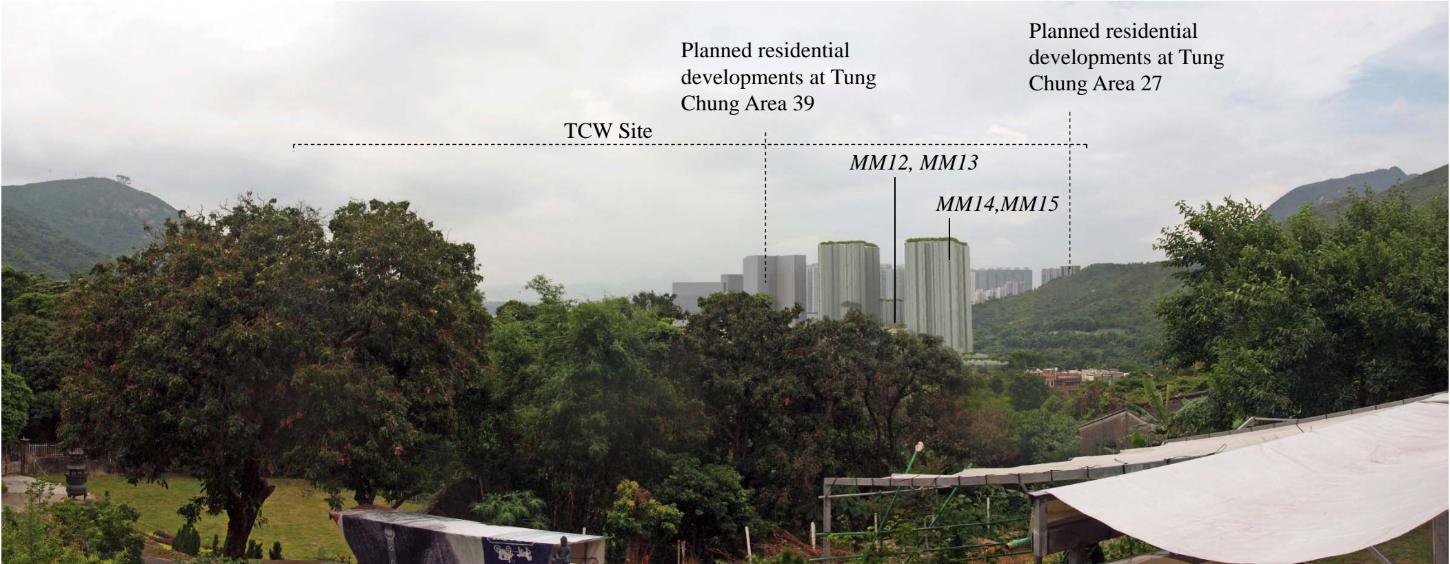
VSR 23 Photomontage- with mitigation at Day 1