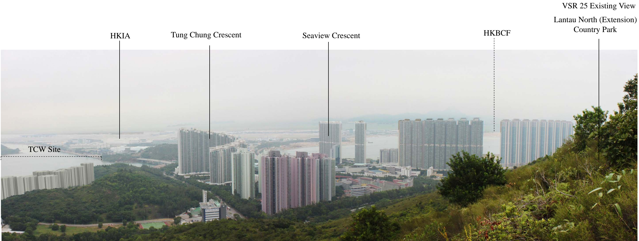
VSR 25 Photomontage- no mitigation at Day 1

Note: 1. The photomontages have been generated to provide a preliminary idea on the scale and extent of the proposed development. These images will be subject to change and are for illustrative purposes only. Built form demonstrates scale and massing only, it does not represent architectural design, finishes or any other related detailed design components.