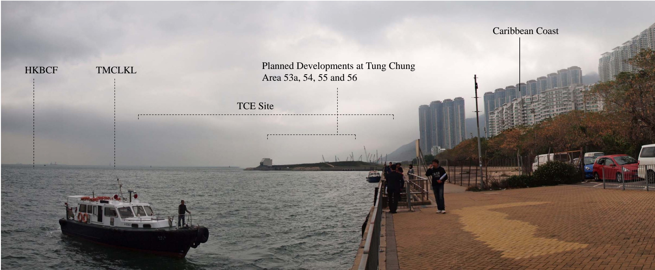
VSR26 Existing View