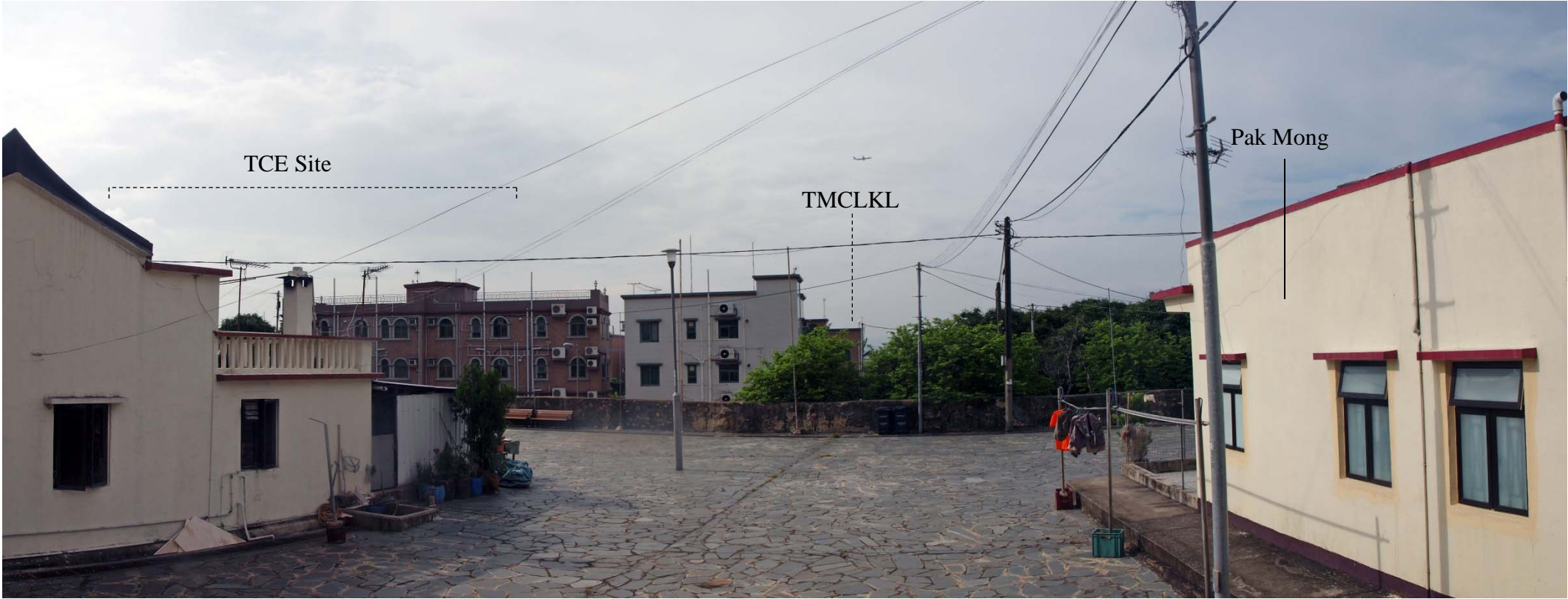
VSR 29 Existing View