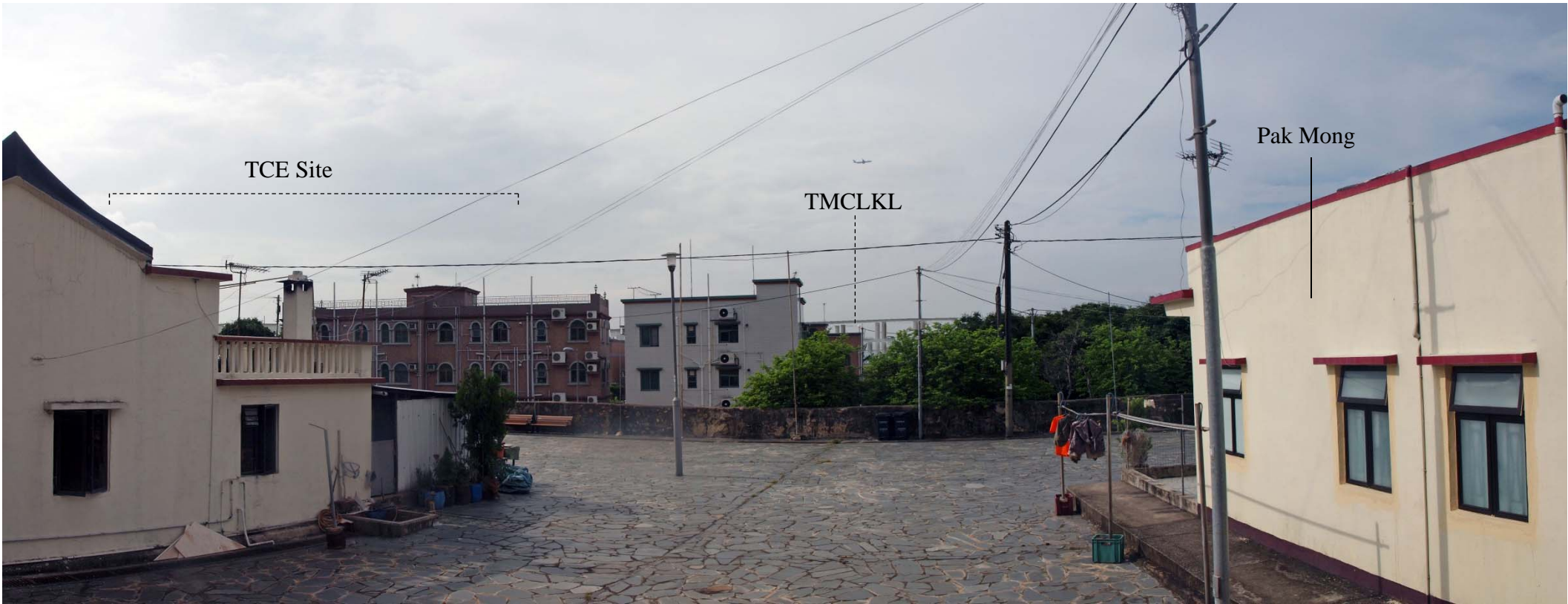
VSR 29 Photomontage- no mitigation at Day 1

Note: 1. The photomontages have been generated to provide a preliminary idea on the scale and extent of the proposed development. These images will be subject to change and are for illustrative purposes only. Built form demonstrates scale and massing only, it does not represent architectural design, finishes or any other related detailed design components.