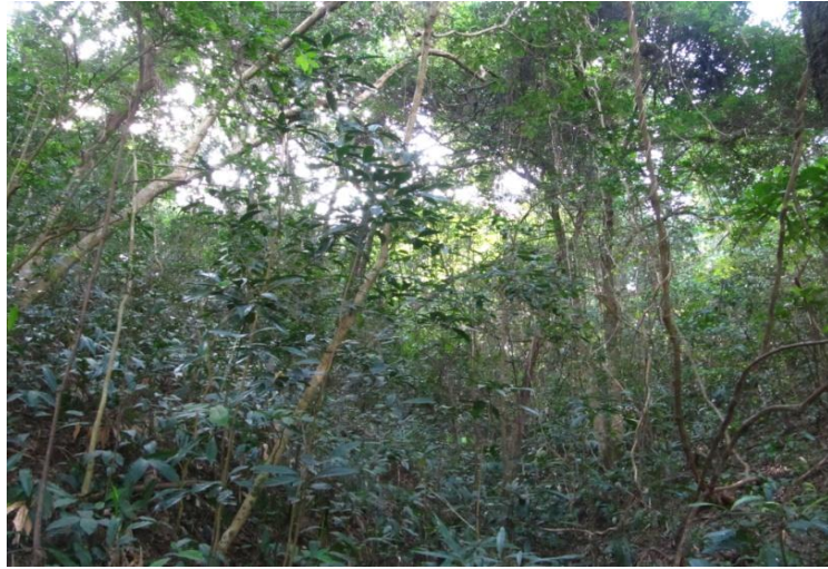
Woodland (near Clear Water Bay Road)