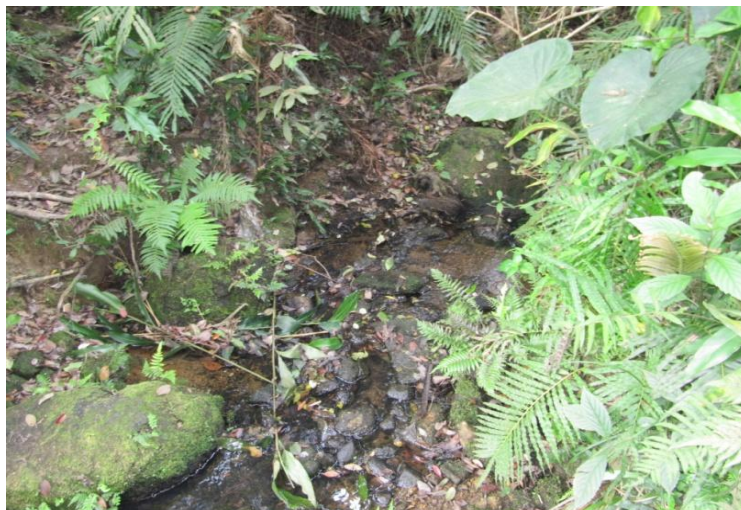
Natural Watercourse (Tseng Lan Shue Stream)