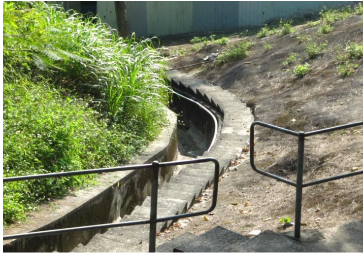
Modified Watercourse (in the south of Po Lam Road)