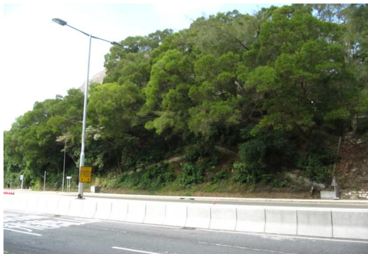
Plantation (along Clear Water Bay Road)