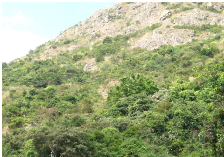
Grassland/ Shrubland (Ma On Shan Country Park)