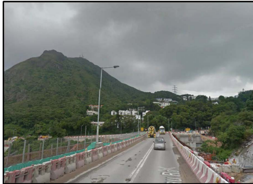
VP8 ON SAN ROAD NORTH