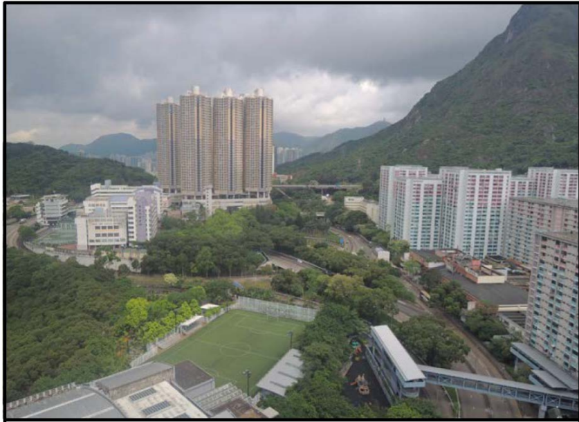
VP4 SHUN ON ESTATE (ON CHUNG HOUSE)