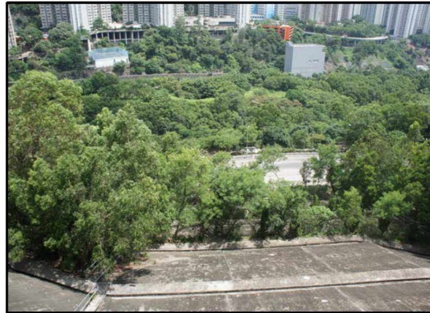
VP9 PO TAI ESTATE SOUTH