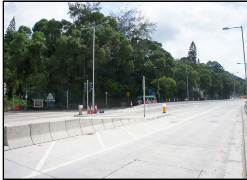
VP5 NEW CLEAR WATER BAY ROAD NORTHEASTERN