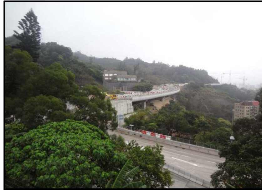
VP6 SIENNA GARDEN SOUTH