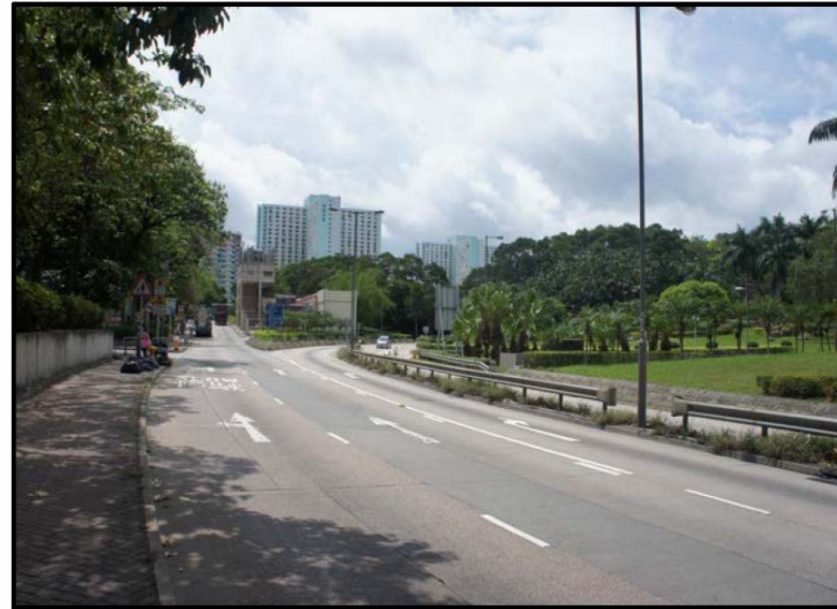
VP2 SHUN CHING STREET SOUTHEASTERN