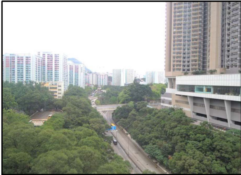
VP1 NEW CLEAR WATER BAY ROAD SOUTHEASTERN