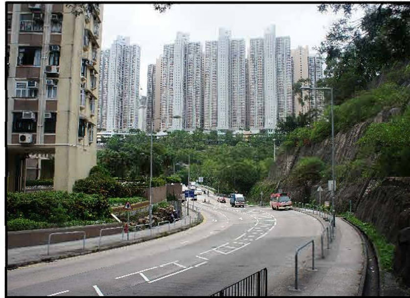
VP11 LIN TAK ROAD NORTH EASTERN