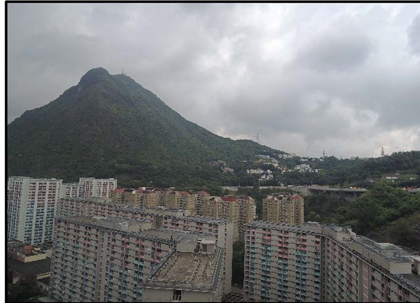
VP13 SHUN ON ESTATE NORTH