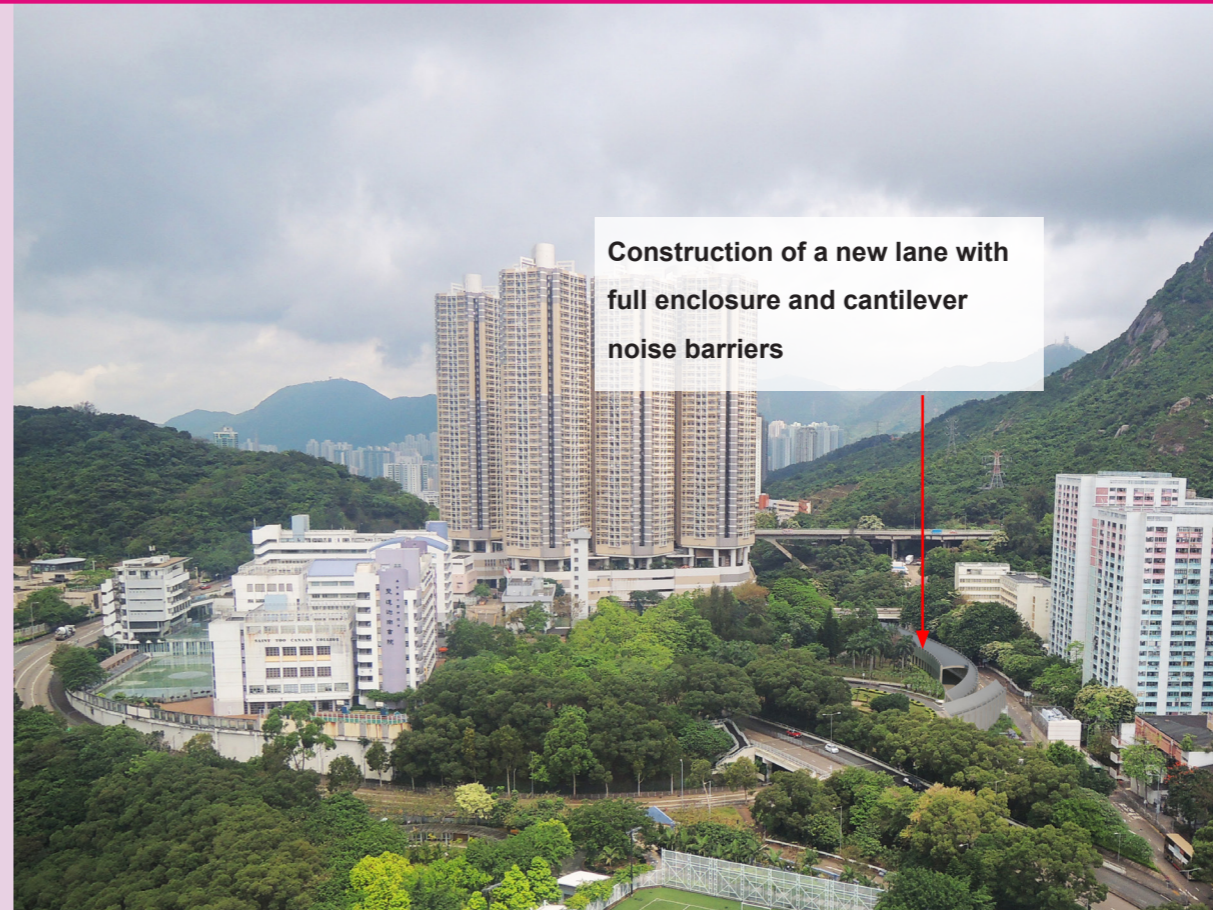
10 Years with Mitigation Measure