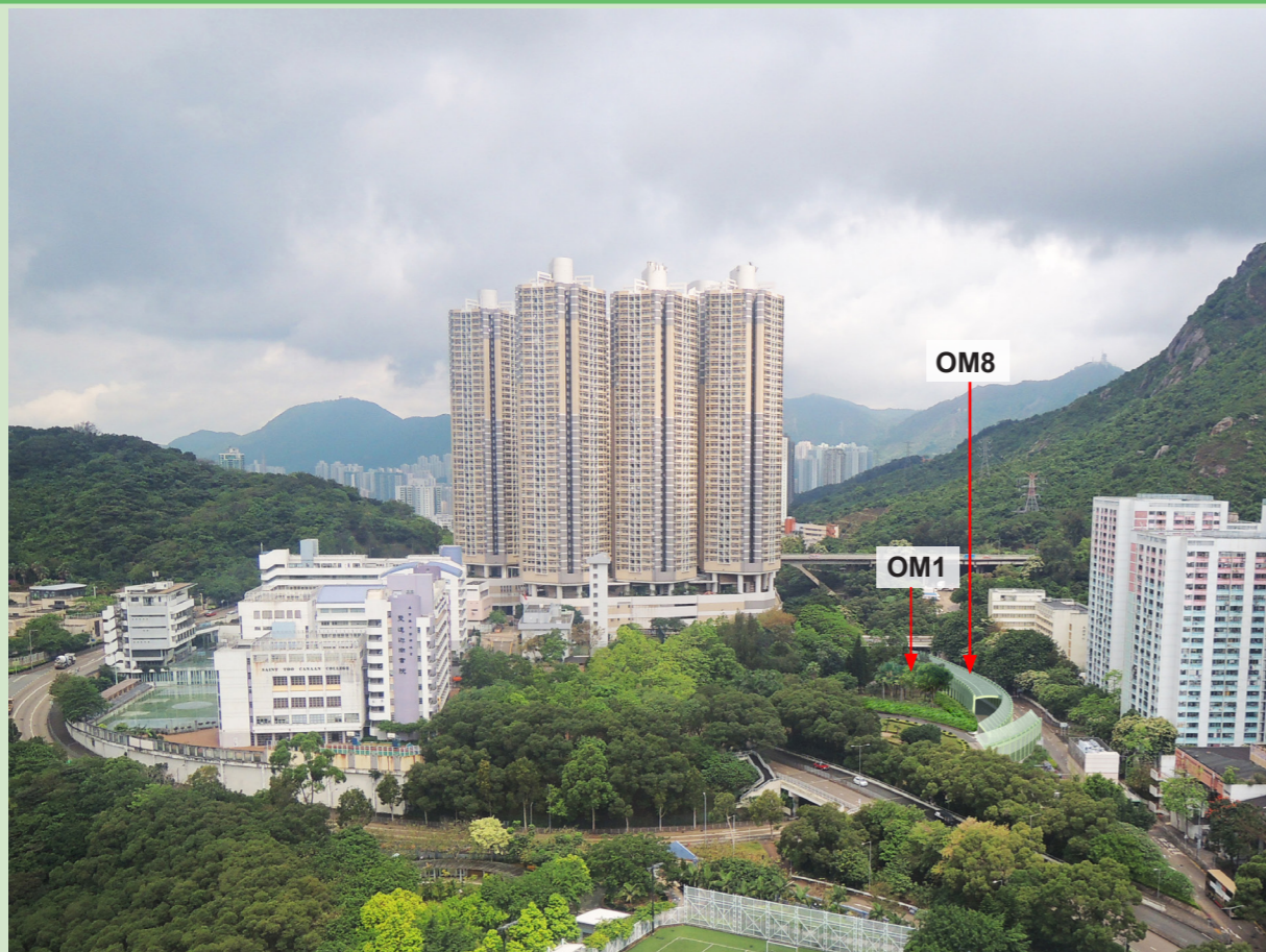
Day 1 with Mitigation Measure