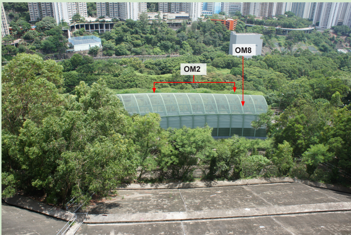
Day 1 with Mitigation Measure