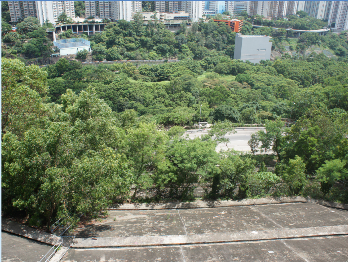
Day 1 with Mitigation Measure