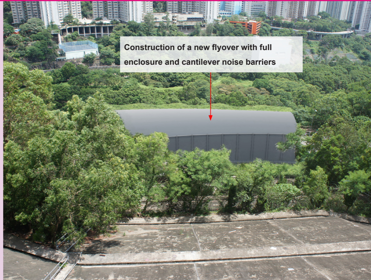
10 Years with Mitigation Measure