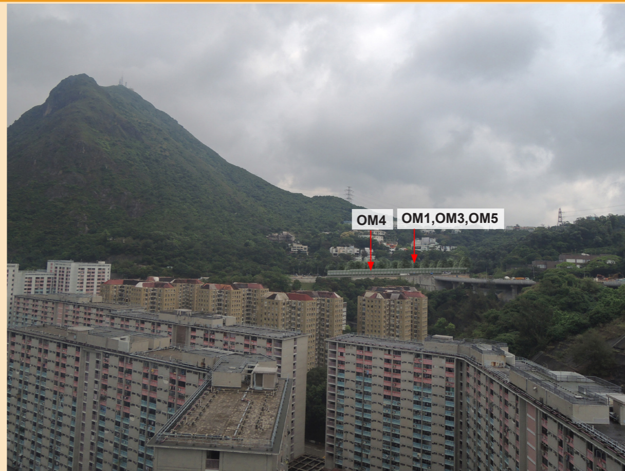
10 Years with Mitigation Measure