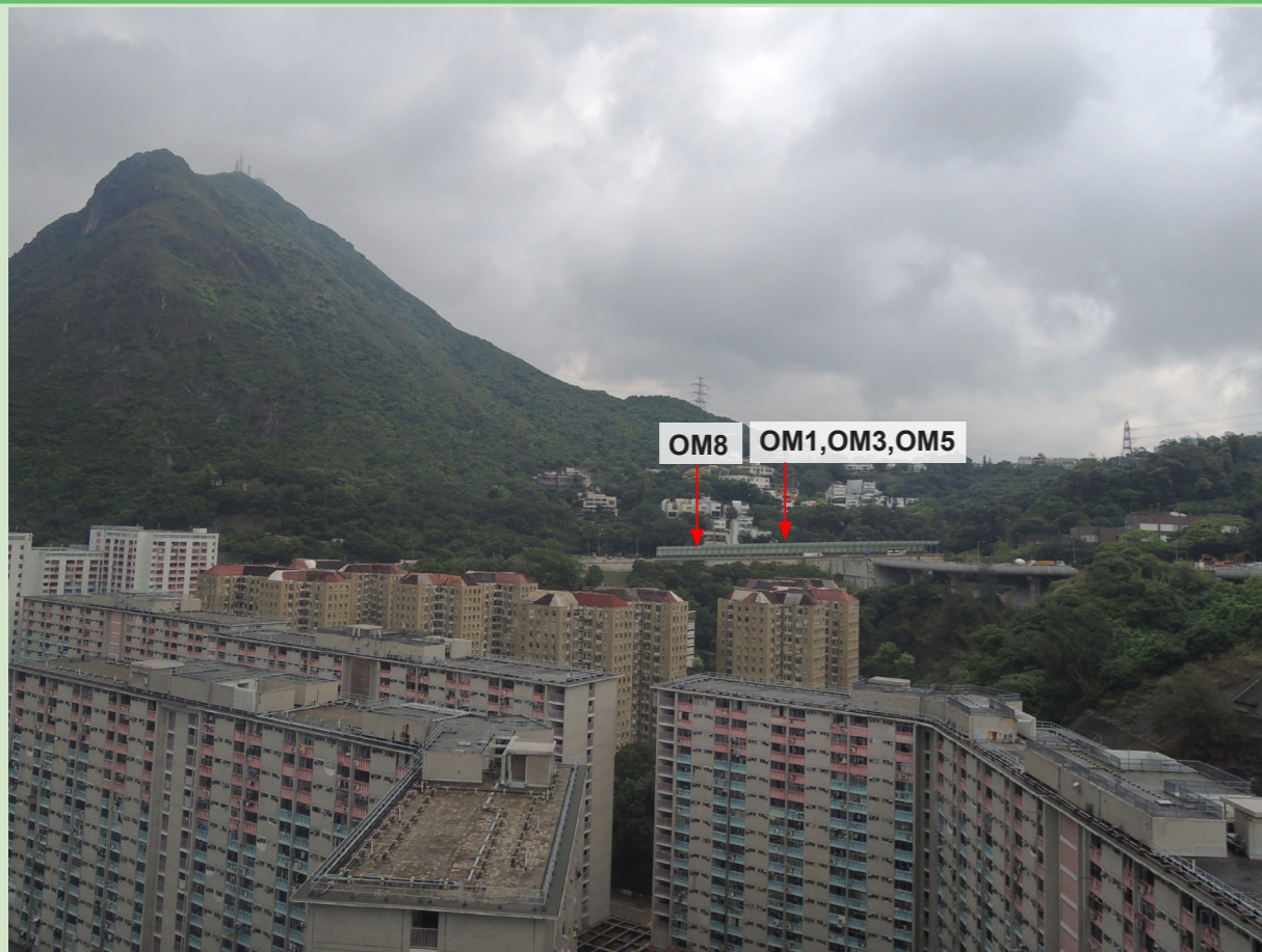
Day 1 with Mitigation Measure

Construction of full enclosure and cantilever noise barriers