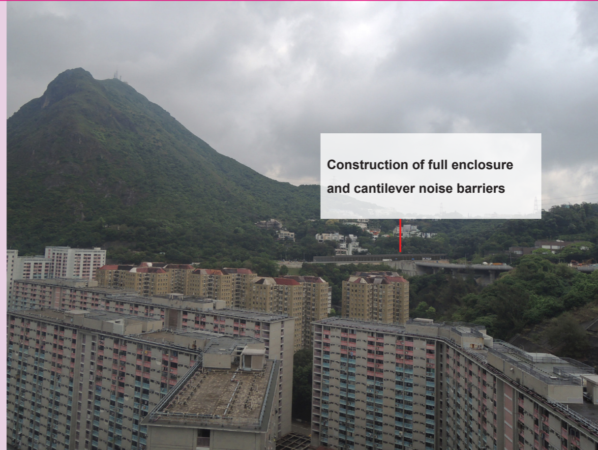
Day 1 without Mitigation Measure

Construction of full enclosure and cantilever noise barriers