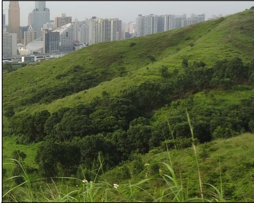
LR1.1 Hillside Woodland Distribute at Valley