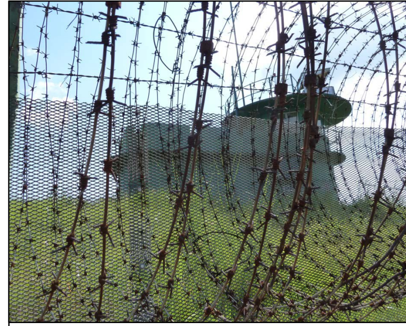
LR10 MacIntosh Fort