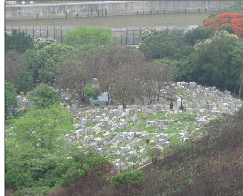
LCA3 Cemetery Landscape