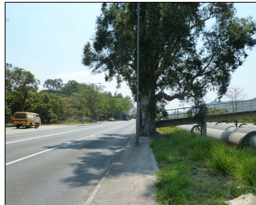
LR16 Transportation Corridor