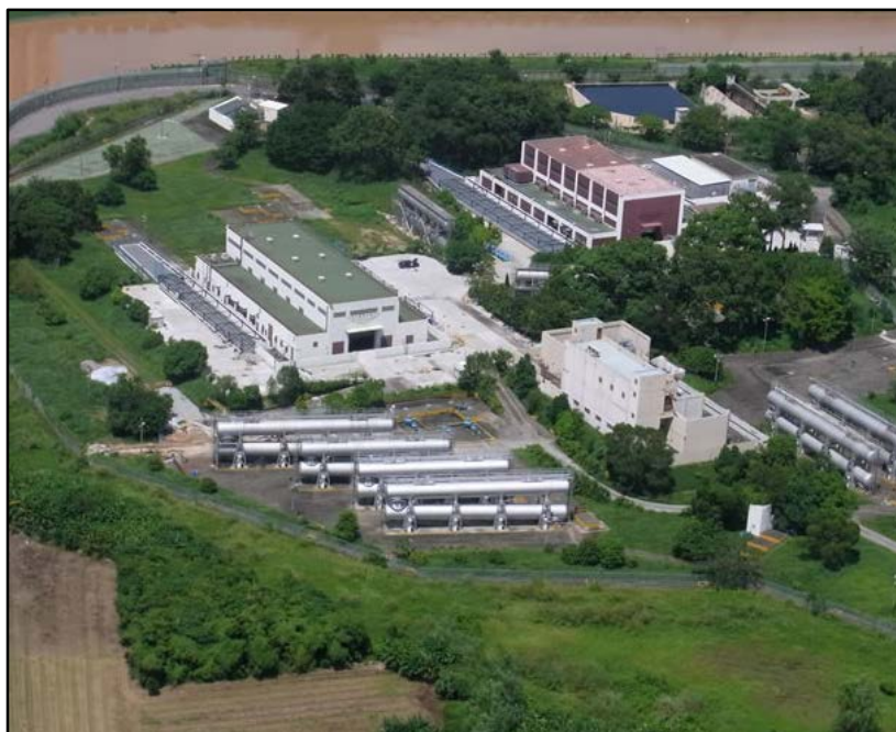
LCA5 Institutional Landscape