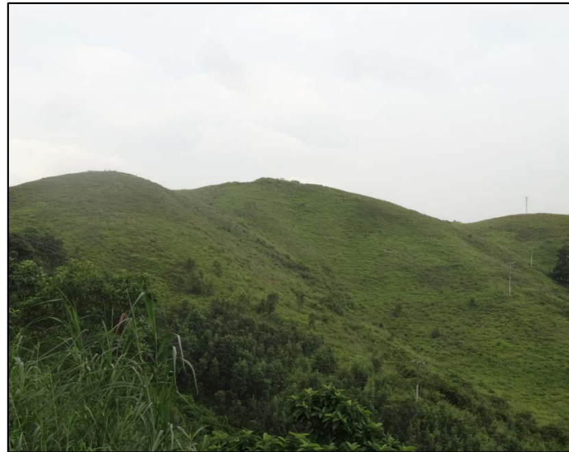
LCA1 Upland and Hillside Landscape