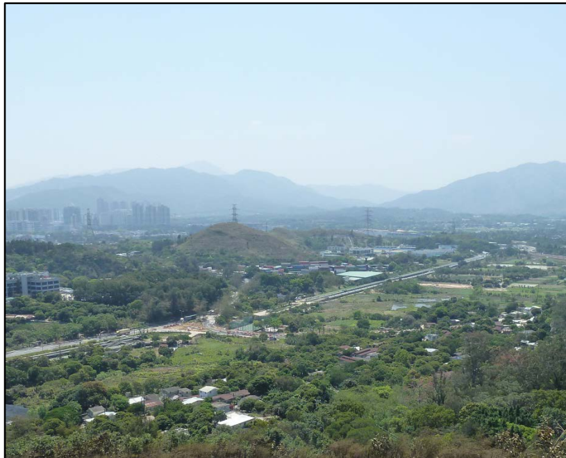
LCA2 Rural Inland Plain Landscape