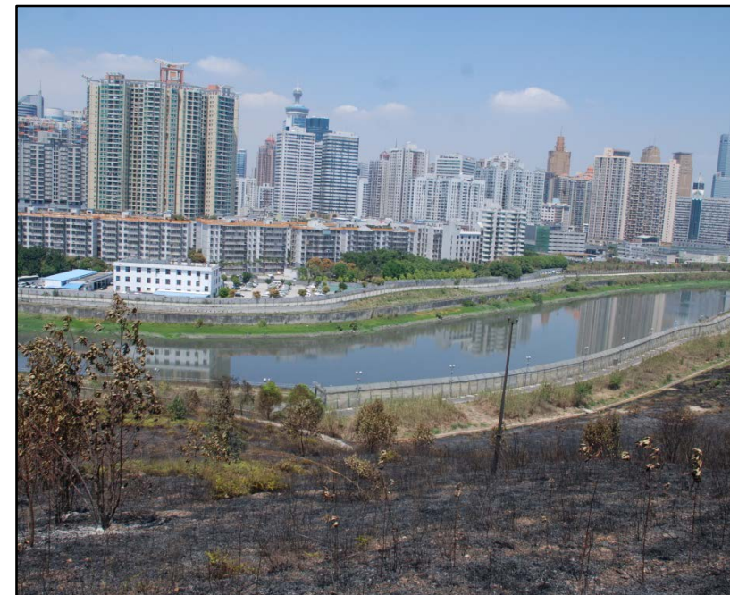
LCA6 Major Watercourse Corridor Landscape