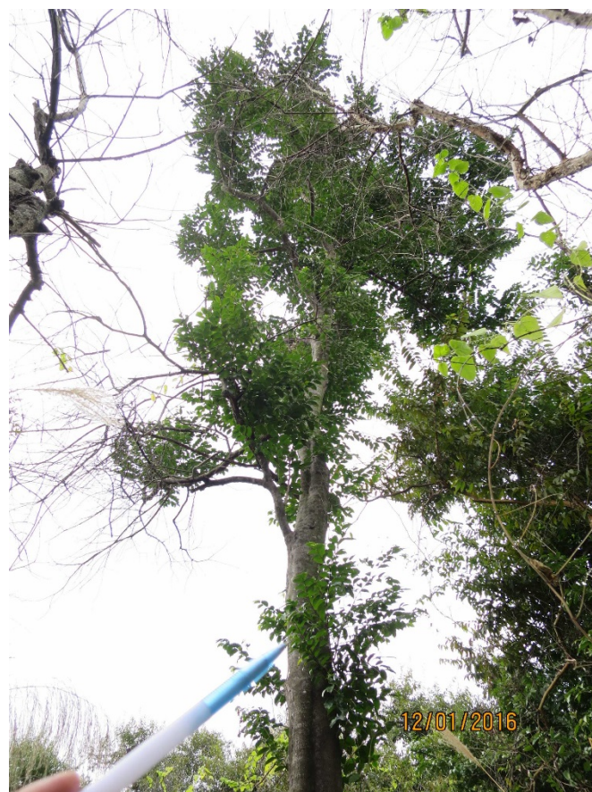
Aquilaria sinensis under LR1.2