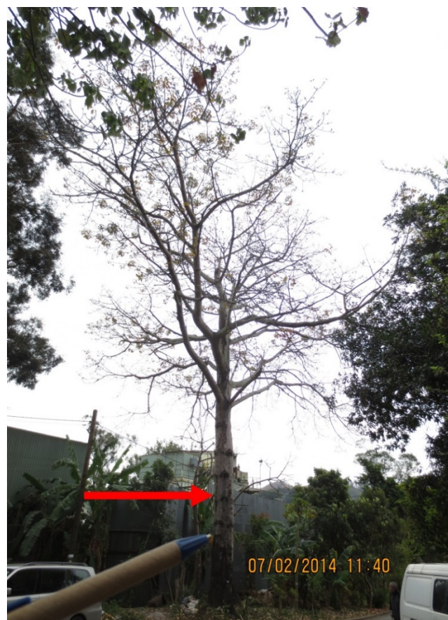
Mature size Bombex ceiba under LR6