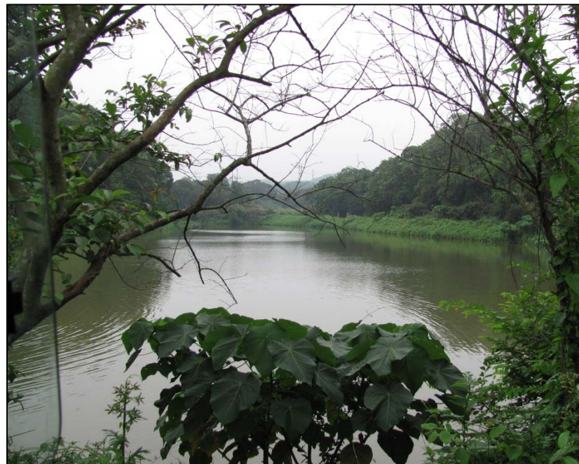
LR5b Active Fish Pond