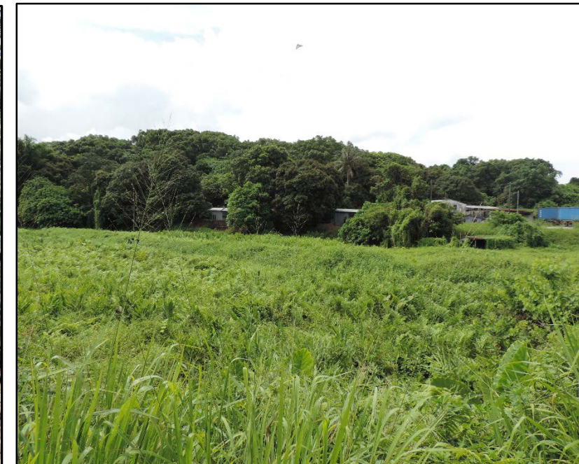
LR7 Marsh and Wetland