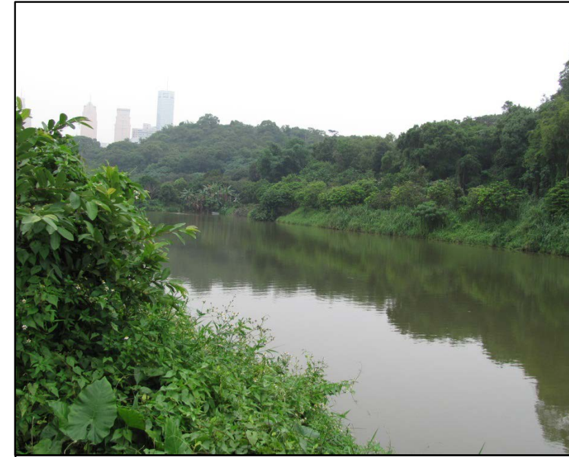
LR5 Active Fish Pond