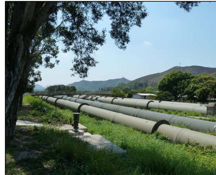
LR17 Vegetation along Utility Facility