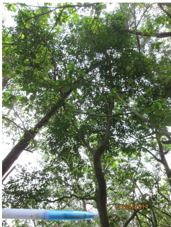
Aquilaria sinensis under LR1.1