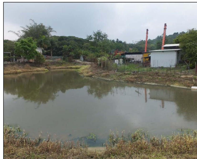
LR20b Abandon Fish Pond