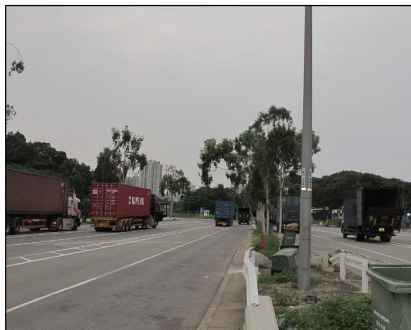
LCA4 Major Transportation Corridor Landscape