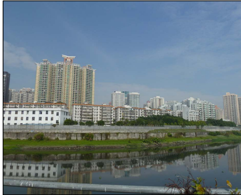
LR4 Riverside Vegetation