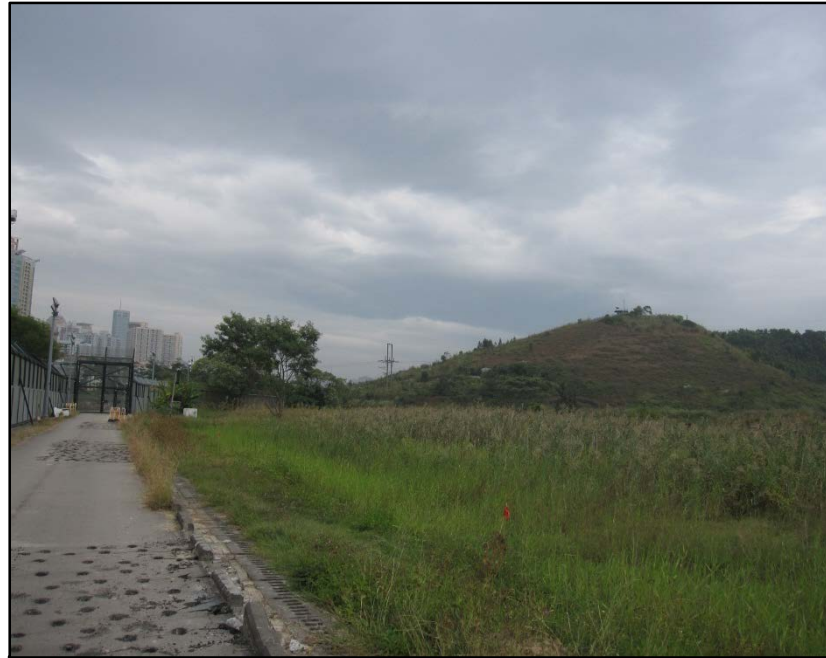
LR3 Lowland Grassland