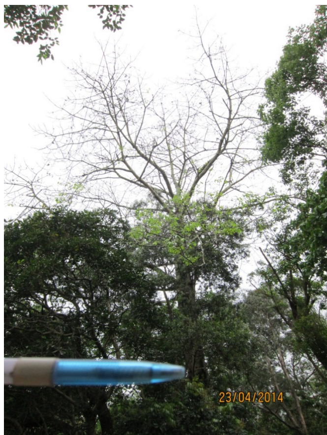
Mature size Bombex ceiba under LR1