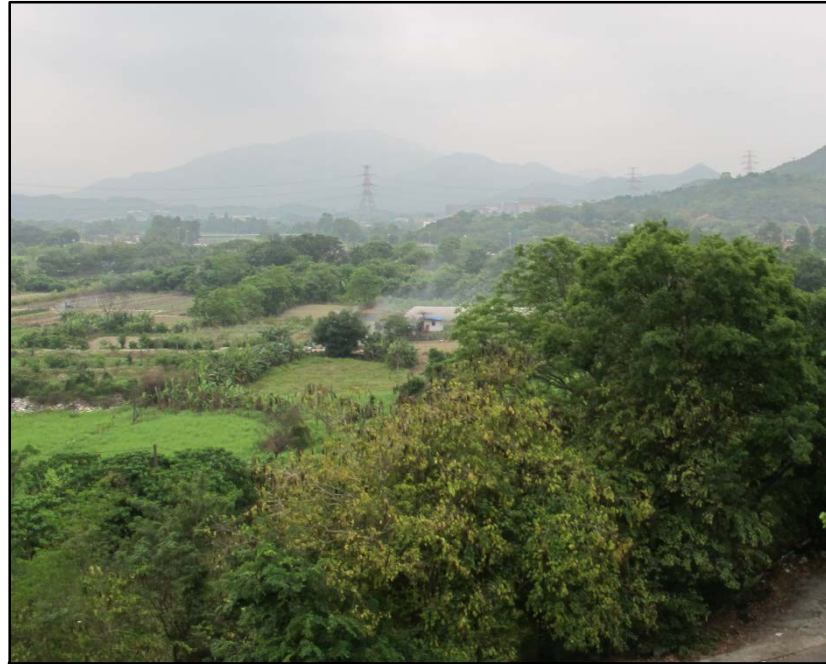
LR8 Lowland Woodland