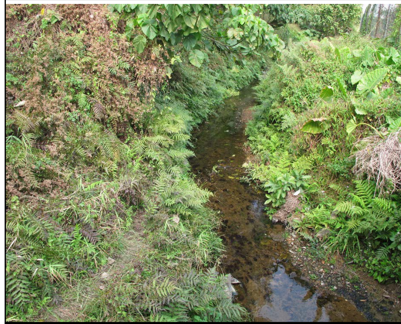
LR14b Natural Water Stream