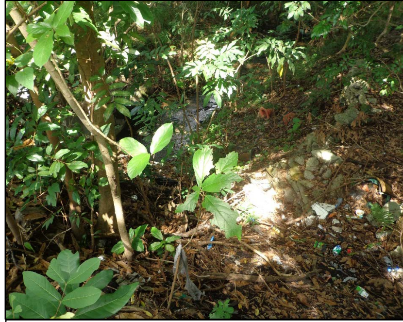
LR14a Natural Water Stream