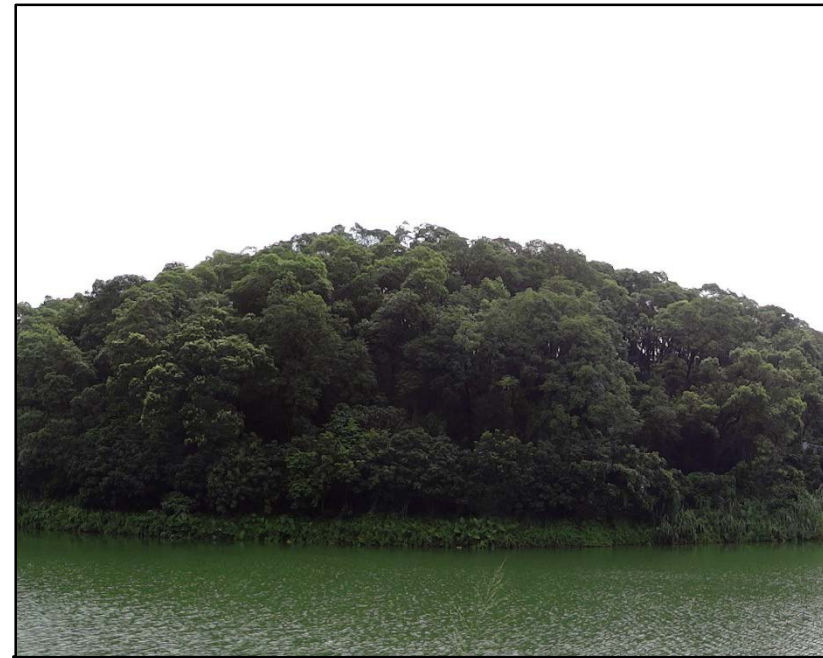
LR1.3 Exposed Uphill Woodland