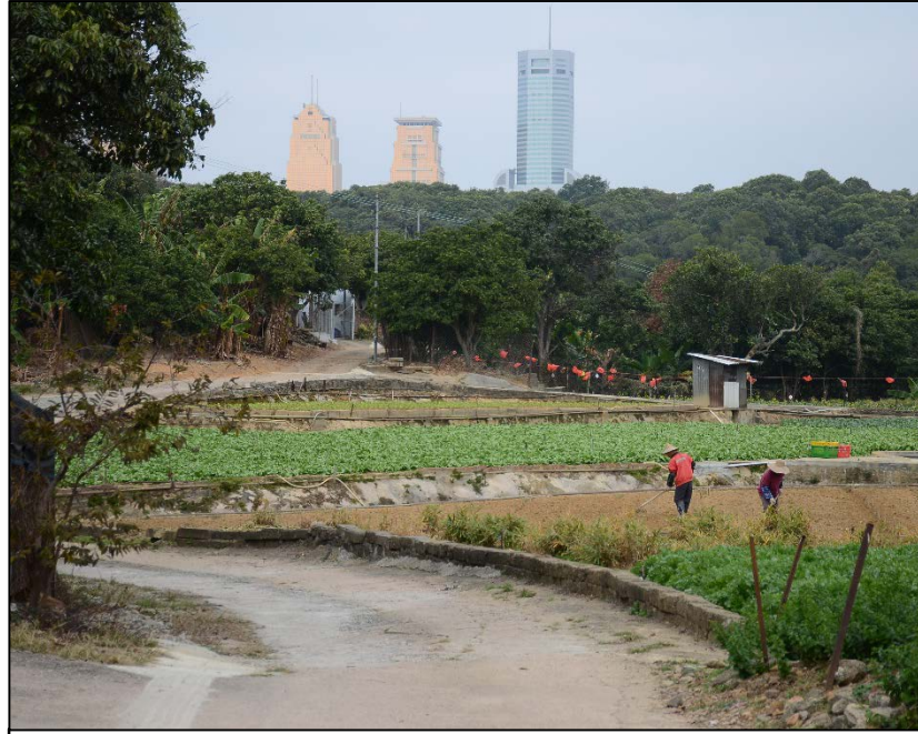
LCA7 Rural Agricultural Landscape