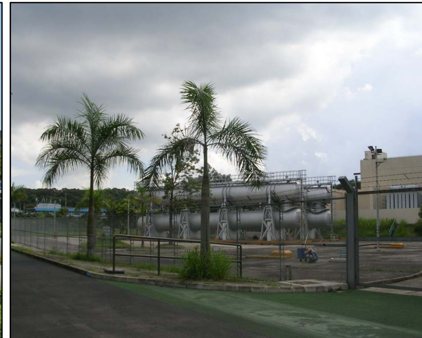
LR18 Pumping Station