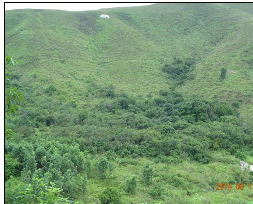
LR21 Wet Woodland