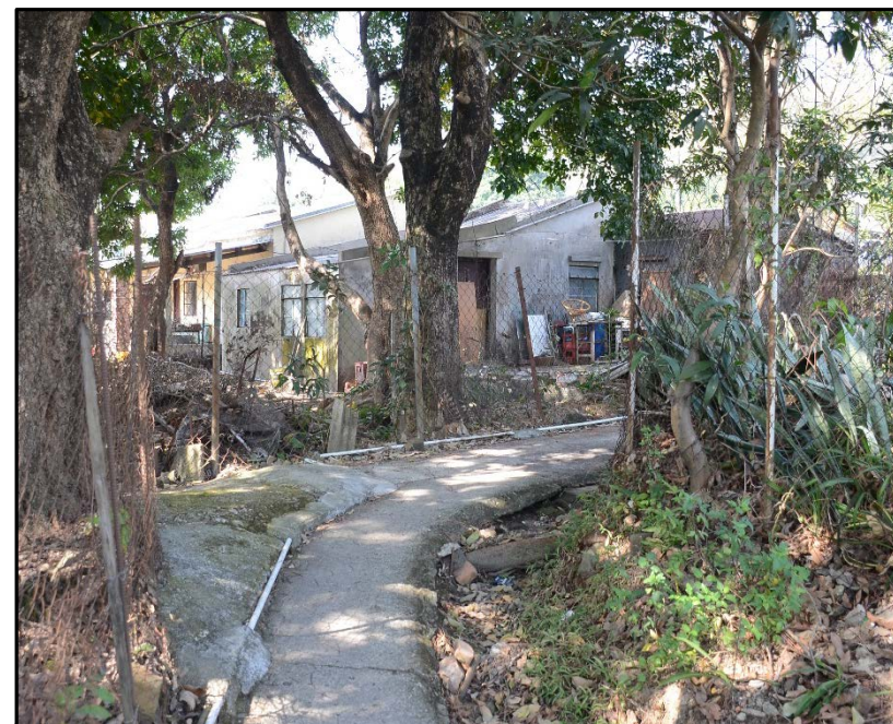
LR6 Rural Development