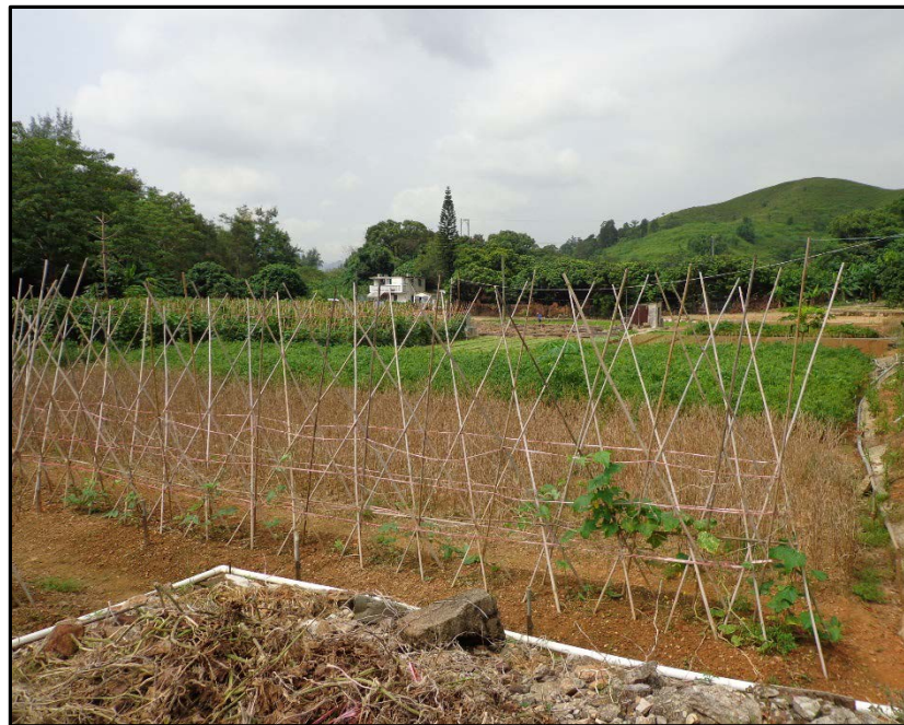
LR11 Agricultural Land