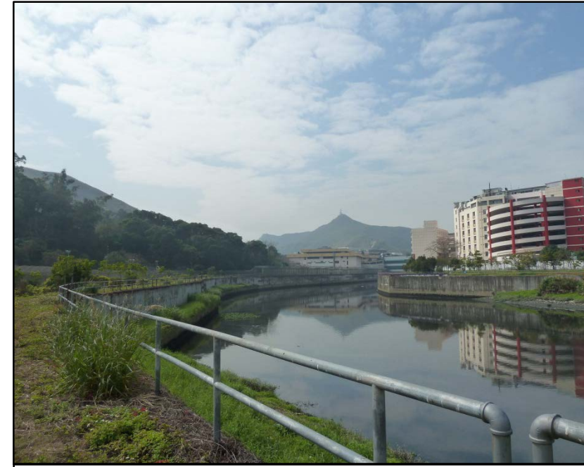
LR15 Channelised River