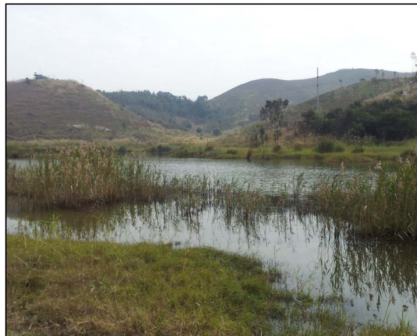
LR20a Abandon Fish Pond