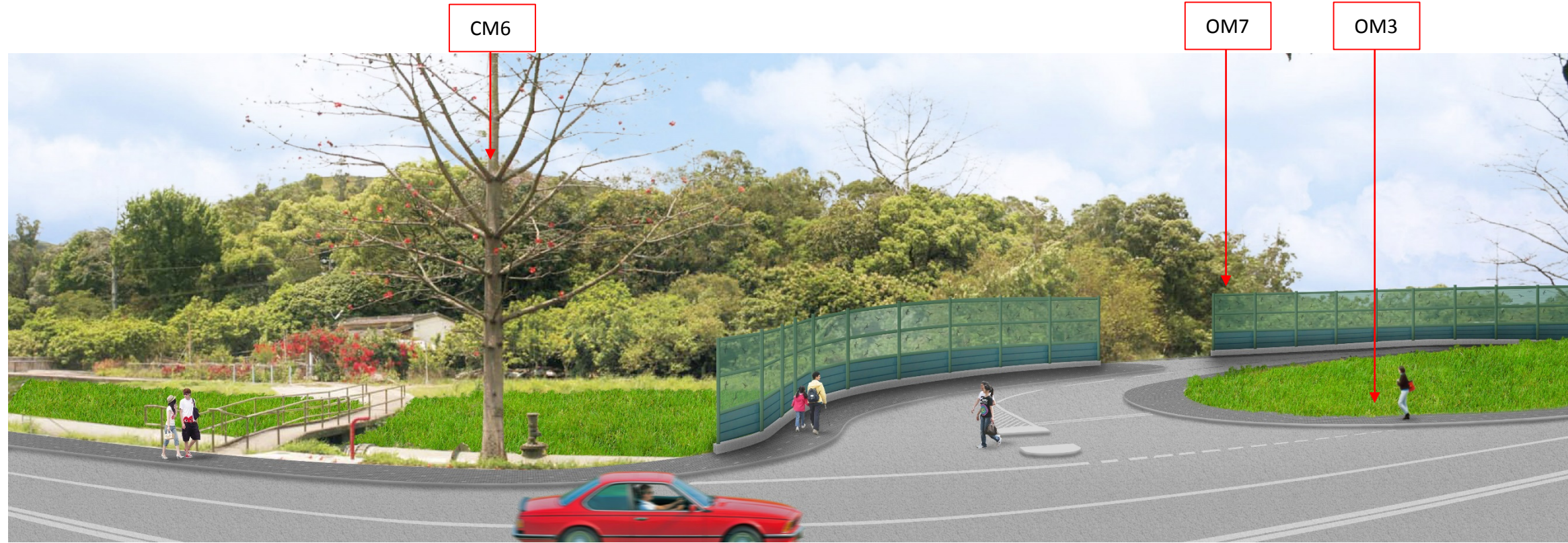
FROM VP2 DAY 1 WITH MITIGATION MEASURES