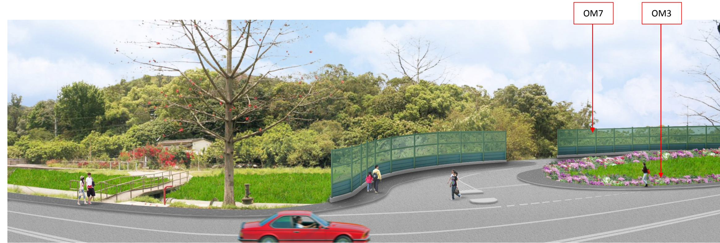
FROM VP2 10 YEARS WITH MITIGATION MEASURES