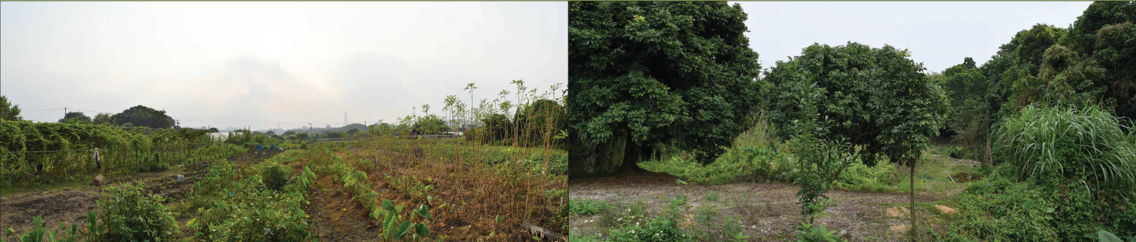
LCA6 HUNG LUNG HANG AGRICULTURAL VILLAGE LANDSCAPE