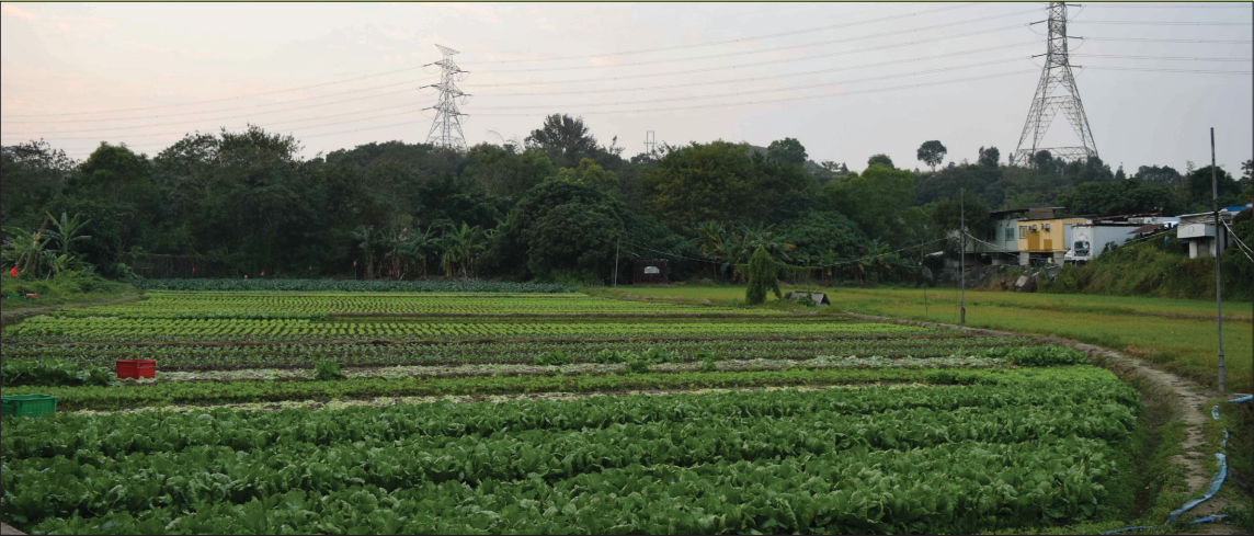
LCA5 SHA LING AGRICULTURAL VILLAGE LANDSCAPE