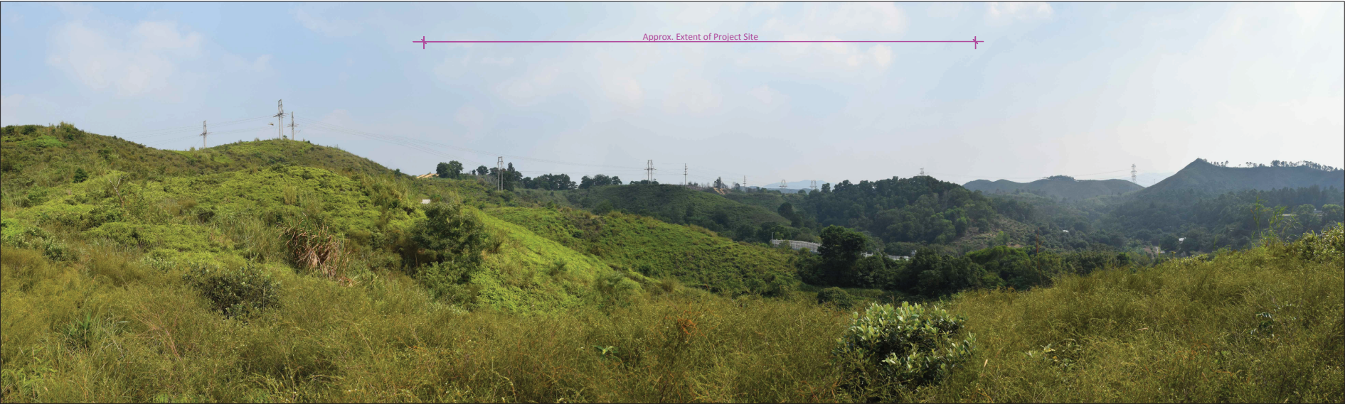
VSR1.2: Pedestrians using hill top footpath by grave sites