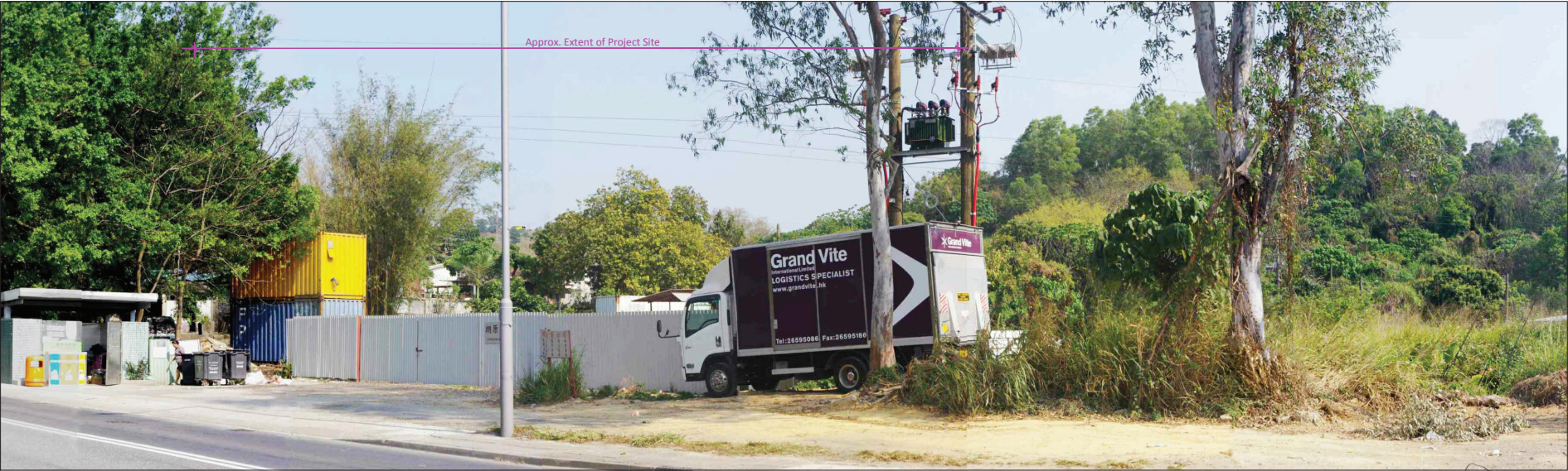
VSR1.3: Vehicle travellers on Man Kam To Road (North)