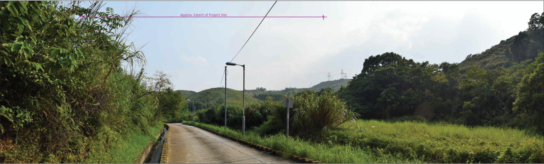
VSR1.1: Vehicle travellers and pedestrian on small rural road