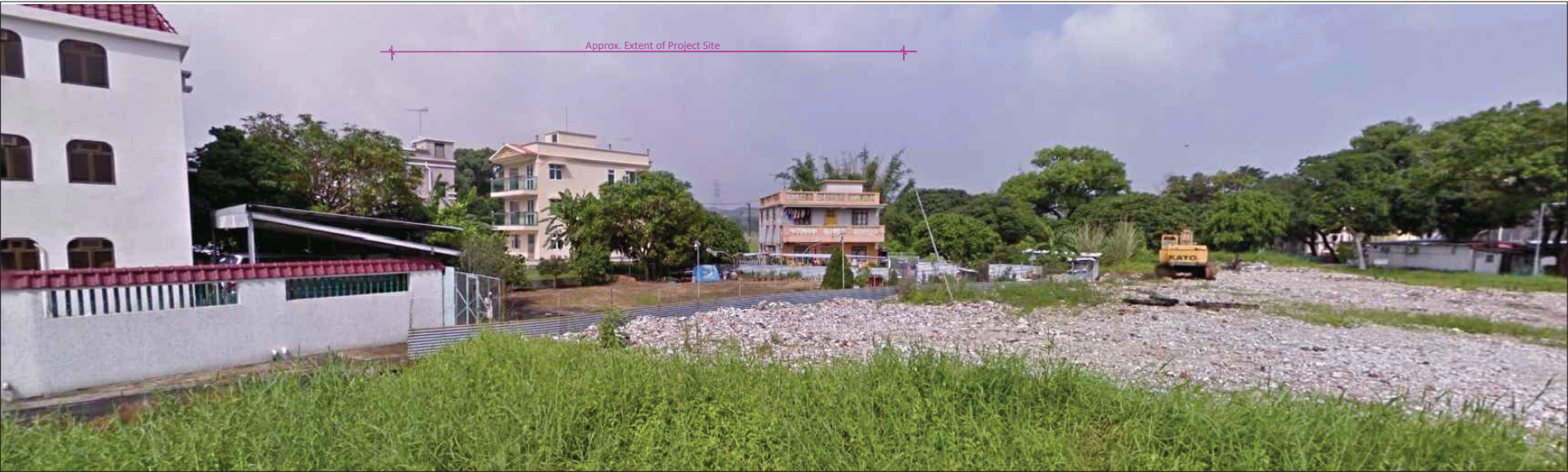
VSR2.2: Residents of Lei Uk San Tsuen