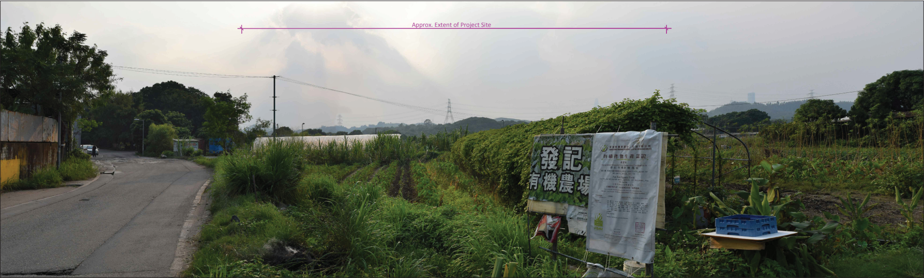
VSR2.3: Agricultural workers in fields of the Ping Yuen River Valley