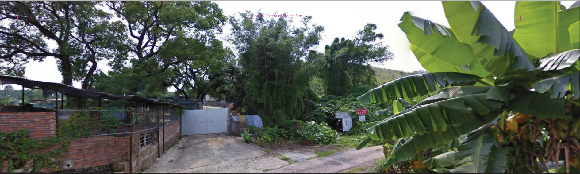
VSR2.1: Workers at the open storage areas in the Ping Yuen River Valley