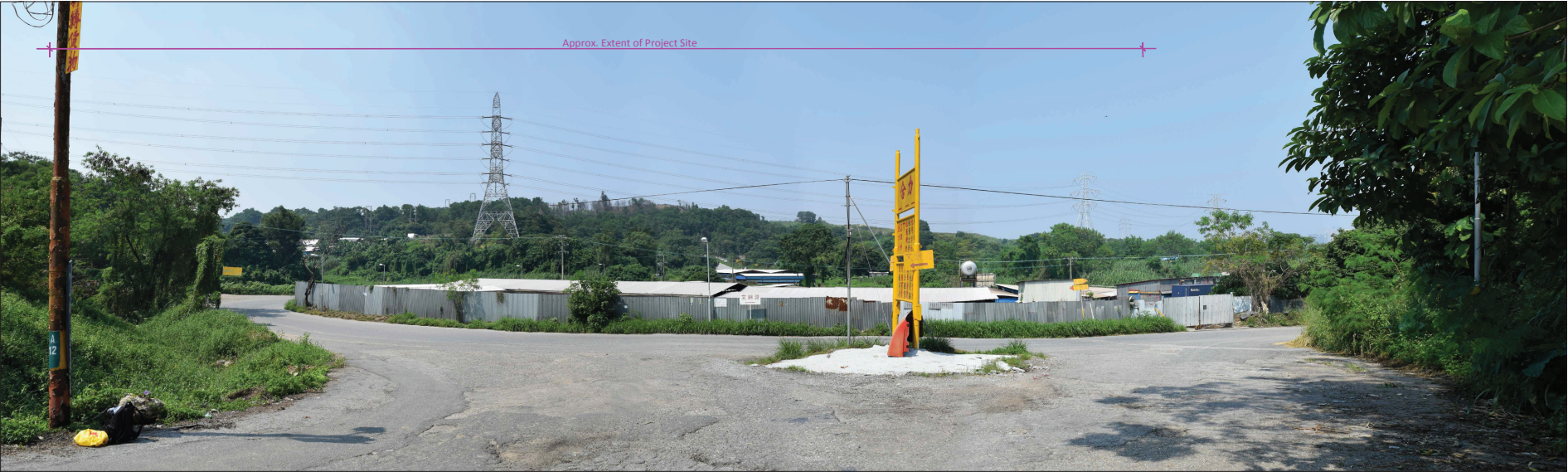
VSR2.5: Vehicle travellers on road to the south of Kong Nga Po Road