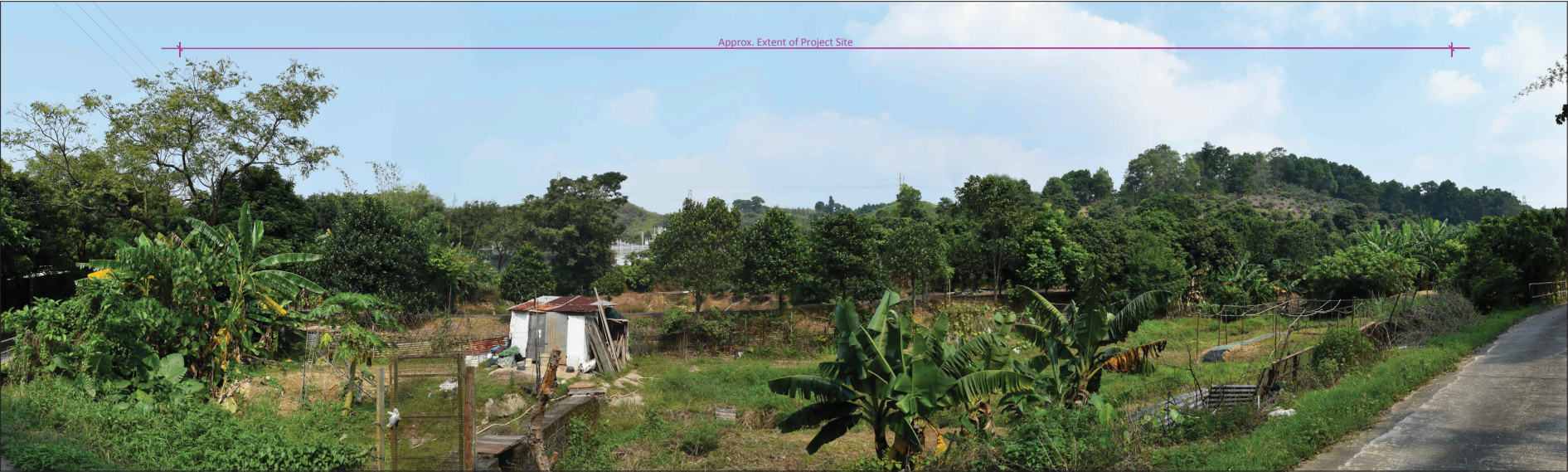
VSR4.3: Vehicle travellers on small rural road (San Uk Ling)