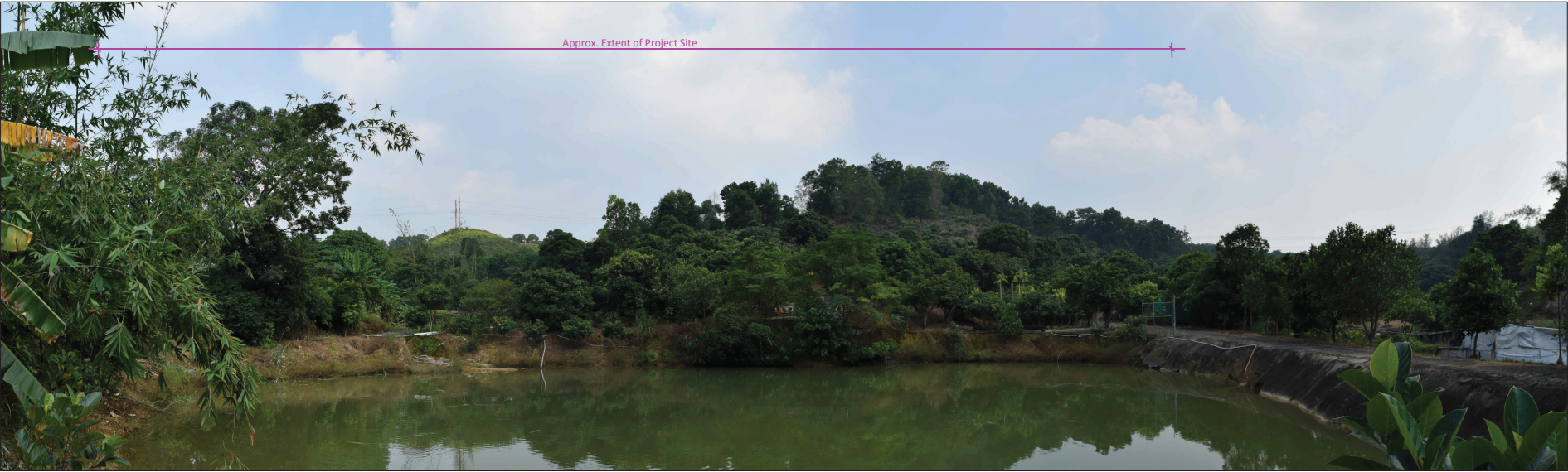
VSR4.1: Residents of San Uk Ling north