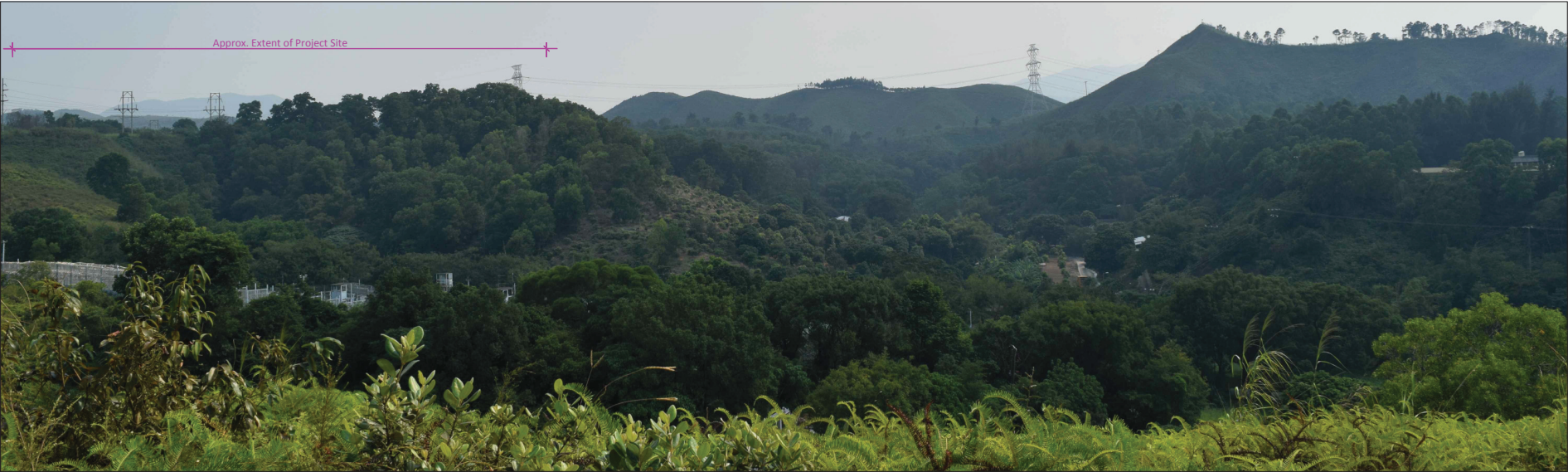
VSR4.2: Workers at the Sha Ling Livestock Waste Control Centre