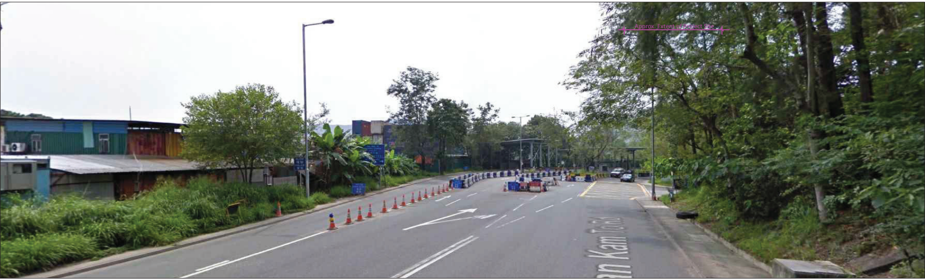
VSR4.7: Vehicle travellers on Man Kam To Road (South)