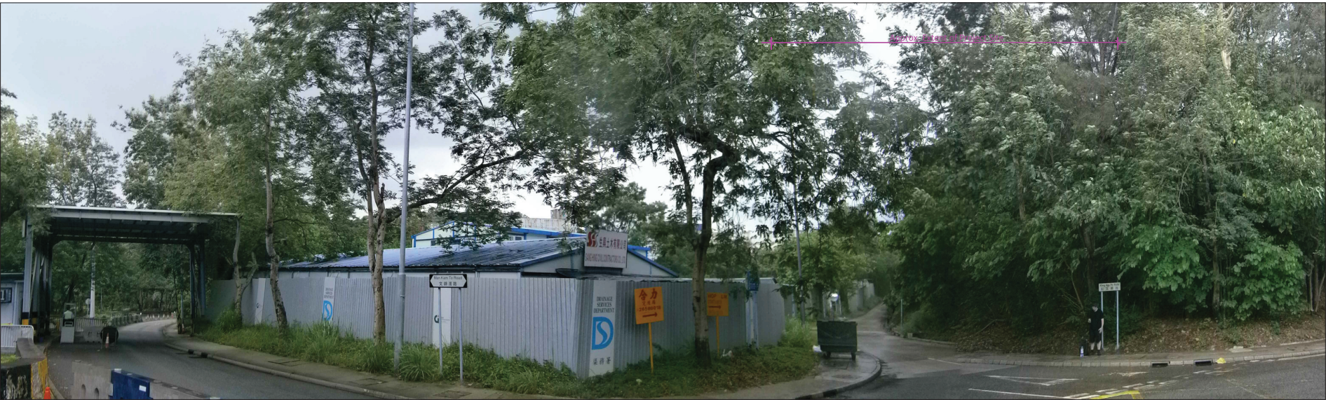
VSR4.8: Workers in the light industrial units to the south of the junction of Man Kam To Road and Kong Nga Po Road