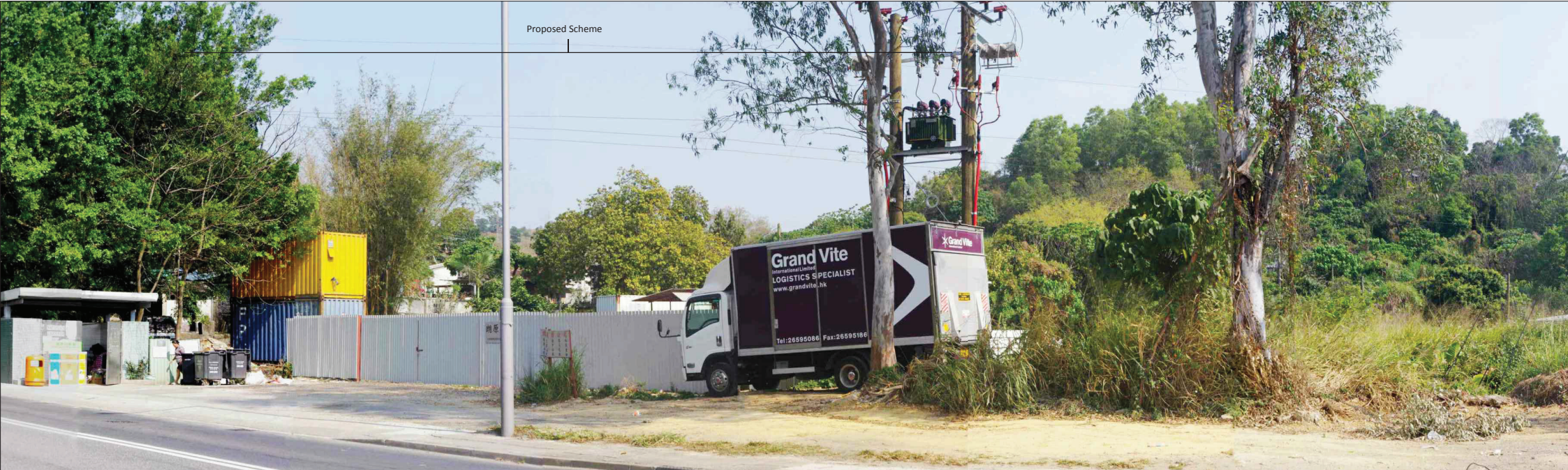
Vantage Point 03: View looking south east for vehicle travellers on Man Kam To Road (North) (VSR1.3) (Existing Situation)