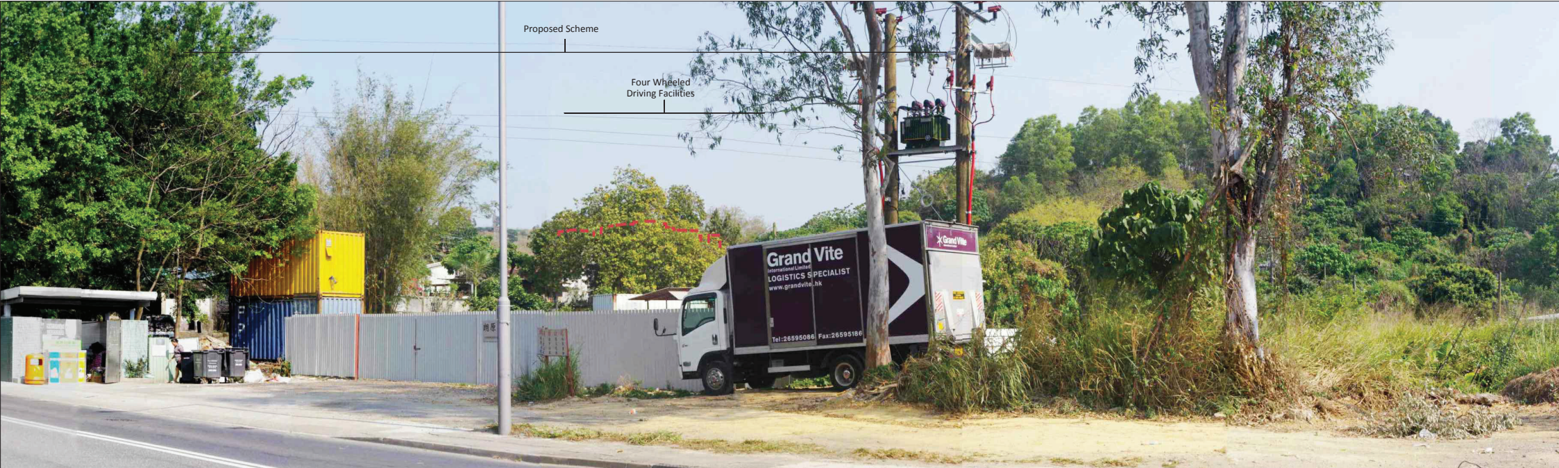
Vantage Point 03: View looking south east for vehicle travellers on Man Kam To Road (North) (VSR1.3) (Day 1 with mitigation measures)