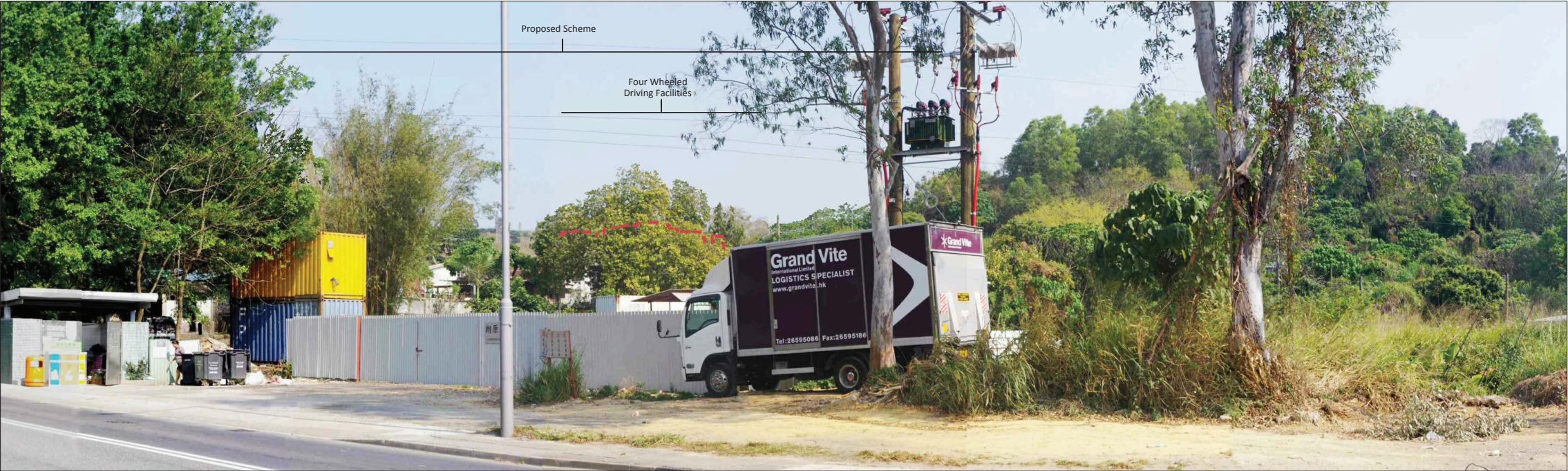
Vantage Point 03: View looking south east for vehicle travellers on Man Kam To Road (North) (VSR1.3) (Year 10 with mitigation measures)