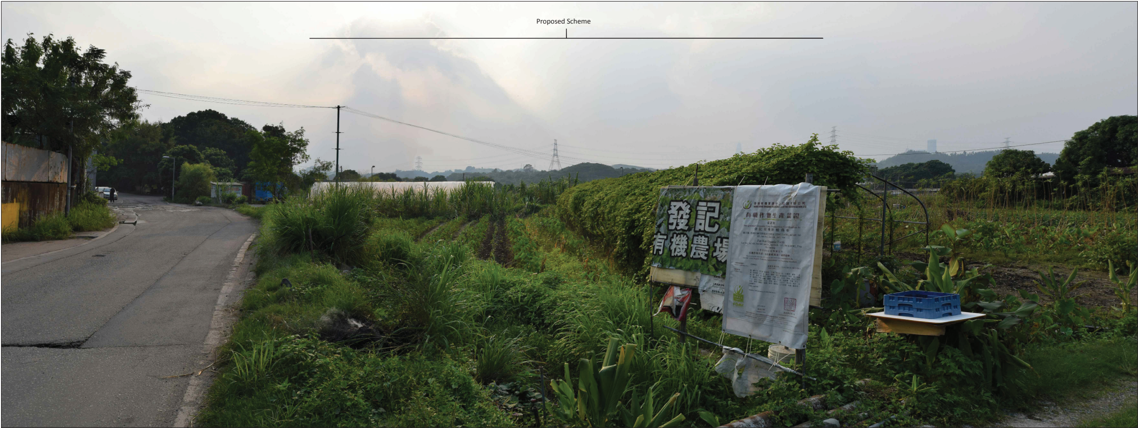
Vantage Point 04: View looking west for agricultural workers in fields of the Ping Yuen River Valley (VSR2.3) (Existing Situation)