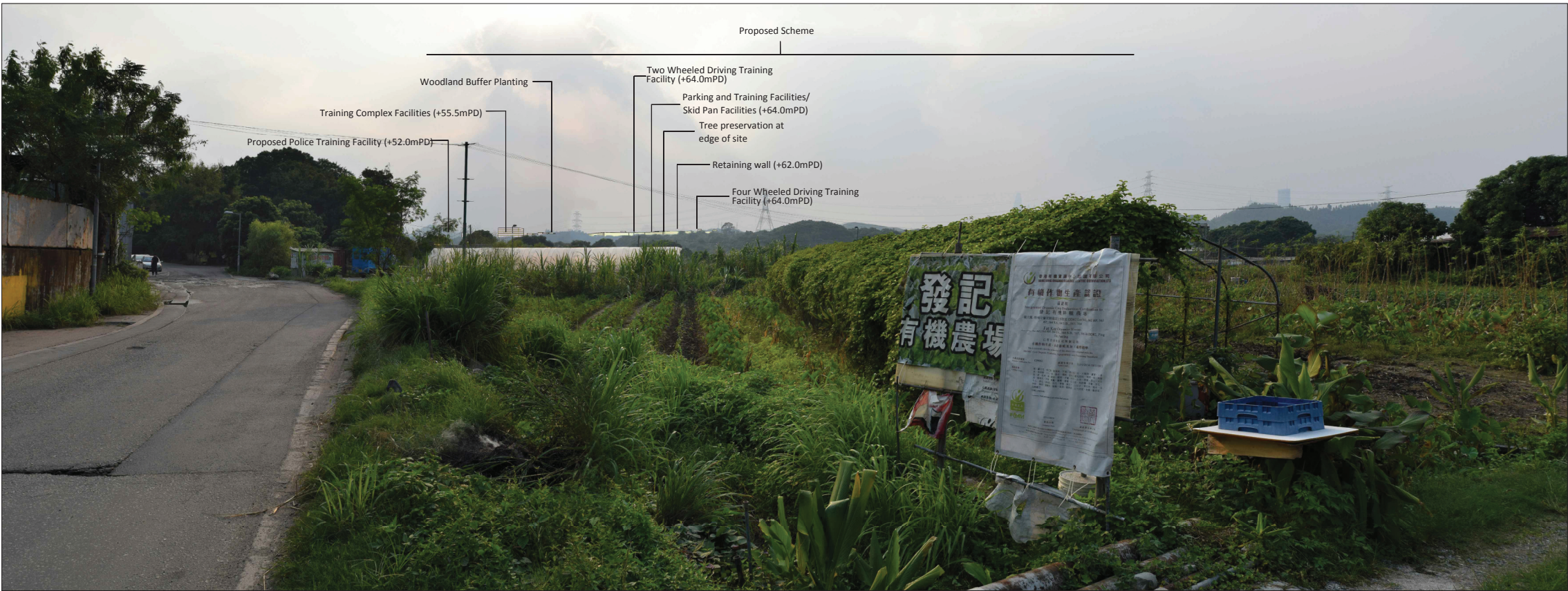
Vantage Point 04: View looking west for agricultural workers in fields of the Ping Yuen River Valley (VSR2.3) (Day 1 with no mitigation measures)