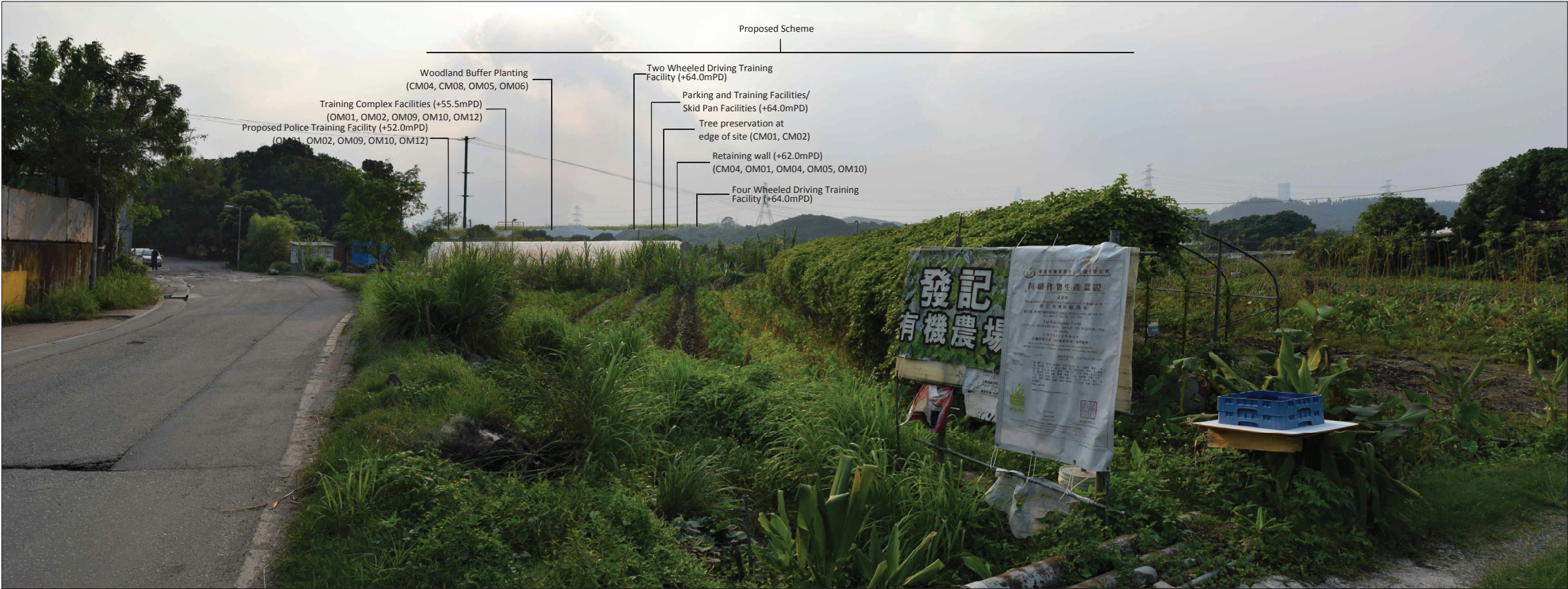
Vantage Point 04: View looking west for agricultural workers in fields of the Ping Yuen River Valley (VSR2.3) (Year 10 with mitigation measures)