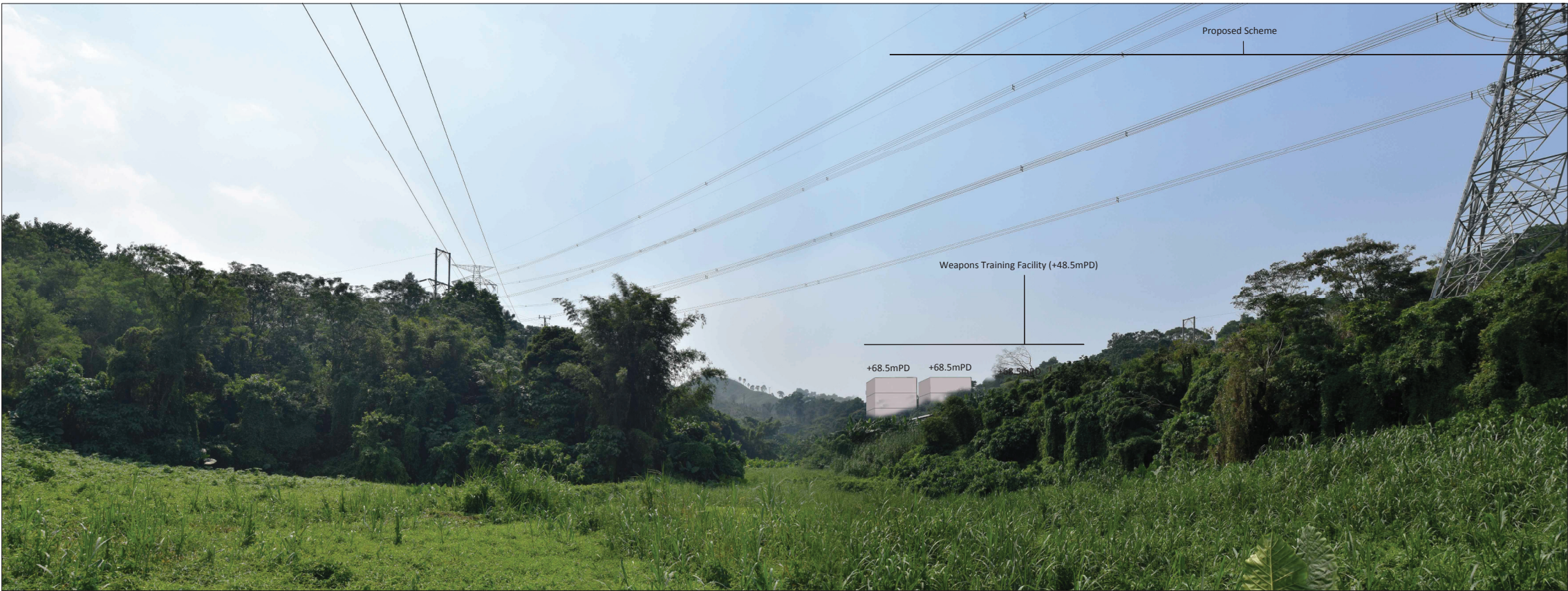
Vantage Point 05: View looking west for vehicle travellers and pedestrians on Kong Nga Po Road (VSR2.4) (Day 1 with no mitigation measures)