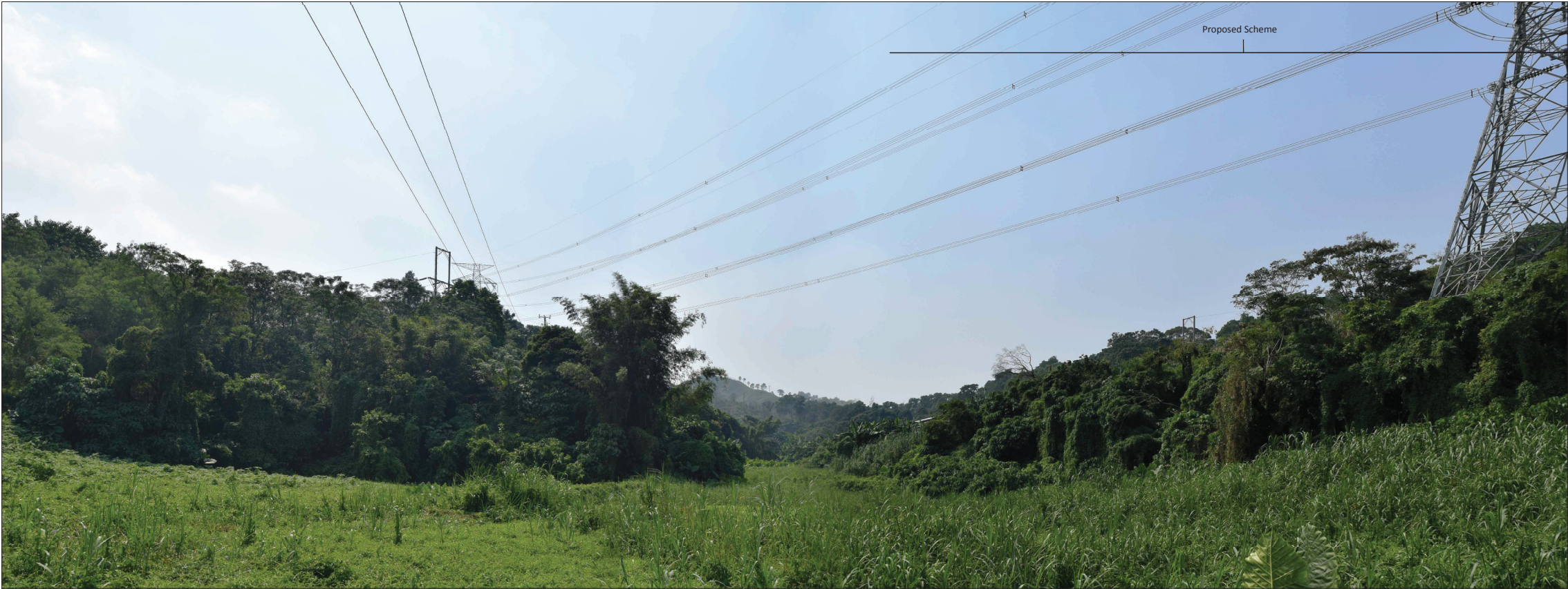
Vantage Point 05: View looking west for vehicle travellers and pedestrians on Kong Nga Po Road (VSR2.4) (Existing Situation)