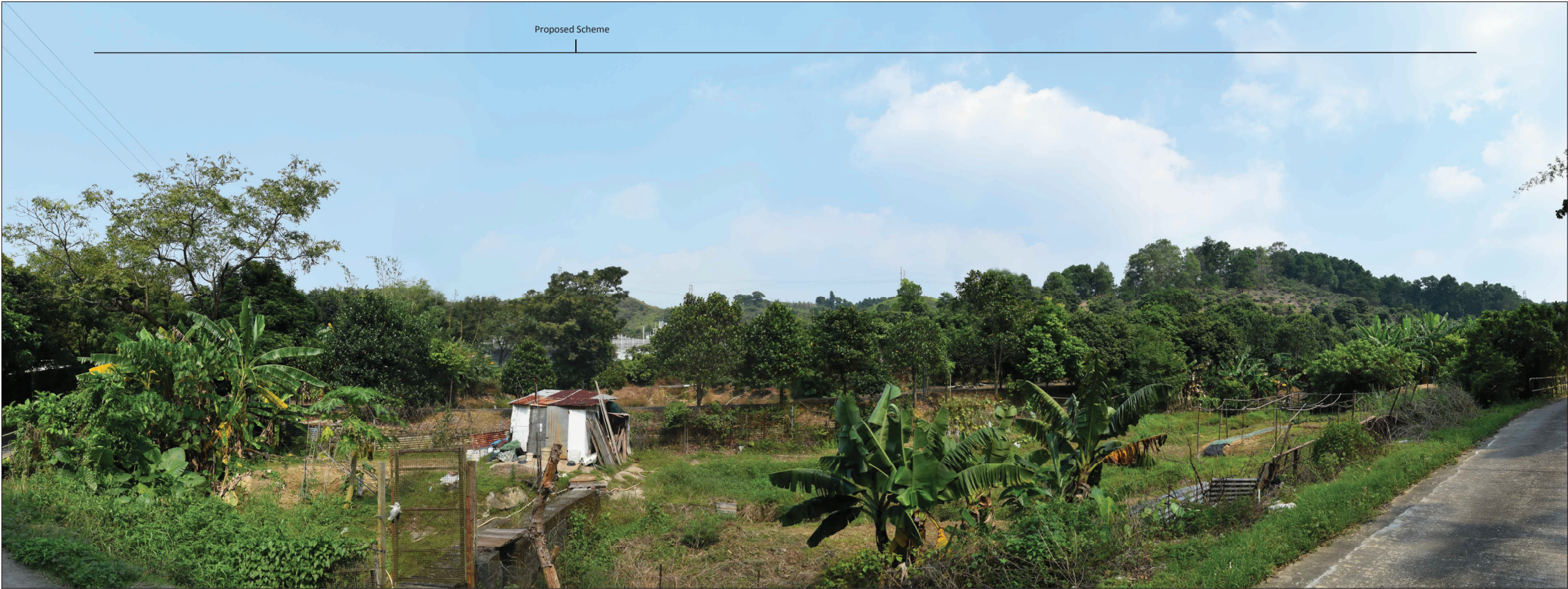
Vantage Point 08: View looking east for vehicle travellers and pedestrians on small rural road (San Uk Ling) (VSR4.3) (Existing Situation)