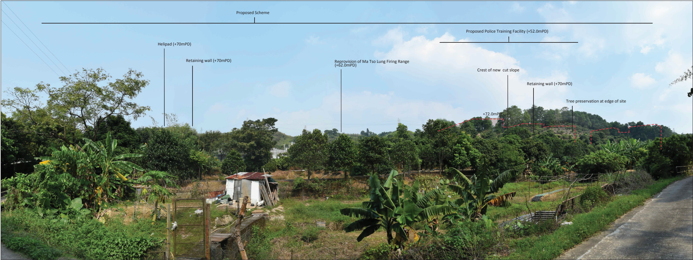
Vantage Point 08: View looking east for vehicle travellers and pedestrians on small rural road (San Uk Ling) (VSR4.3) (Day 1 with no mitigation measures)