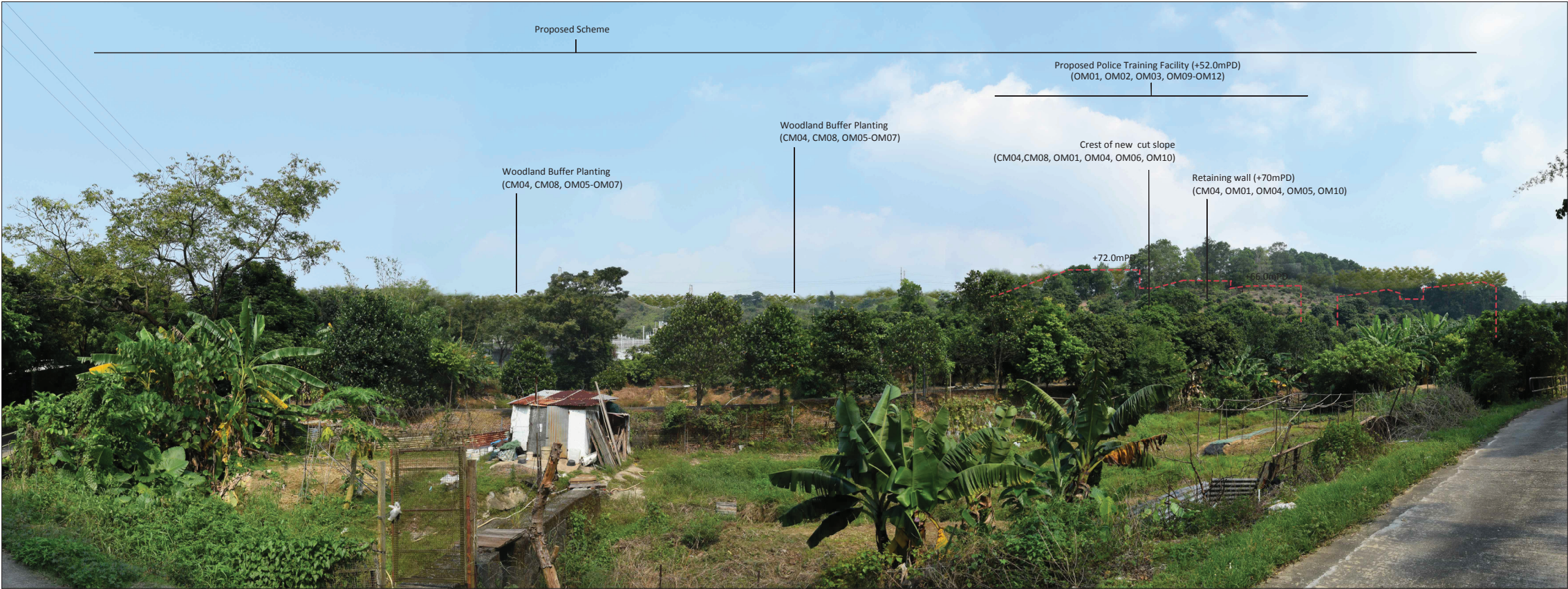
Vantage Point 08: View looking east for vehicle travellers and pedestrians on small rural road (San Uk Ling) (VSR4.3) (Day 1 with mitigation measures)