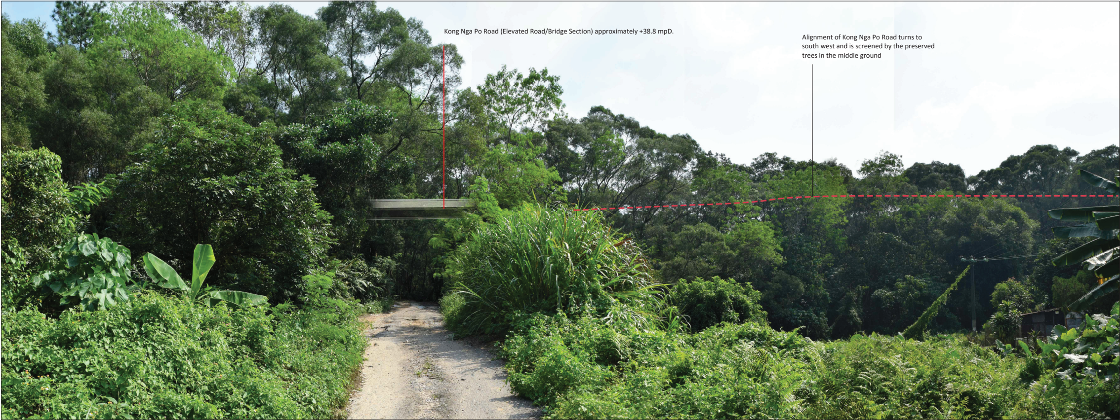
Vantage Point 09: View looking south for residents of agricultural holding north of Kong Nga Po Road (VSR 4.5) (Day 1 with no mitigation measures)