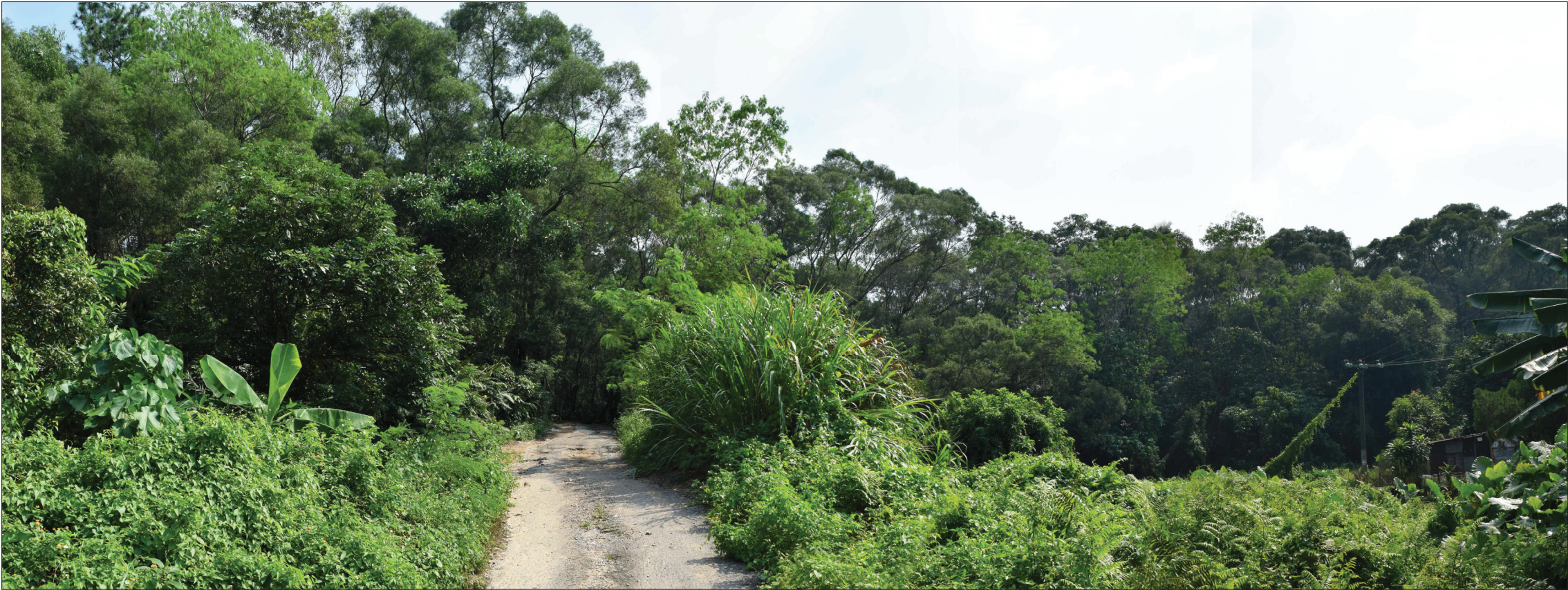
Vantage Point 09: View looking south for residents of agricultural holding north of Kong Nga Po Road (VSR 4.5) (Existing Situation)