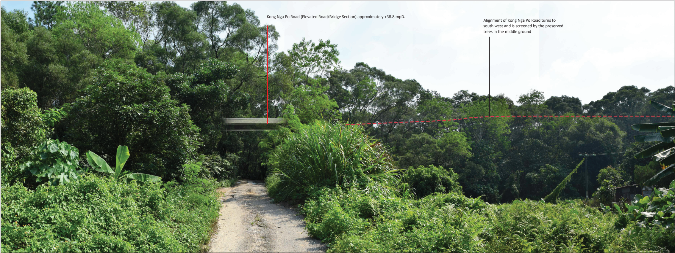
Vantage Point 09: View looking south for residents of agricultural holding north of Kong Nga Po Road (VSR 4.5) (Day 1 with mitigation measures)