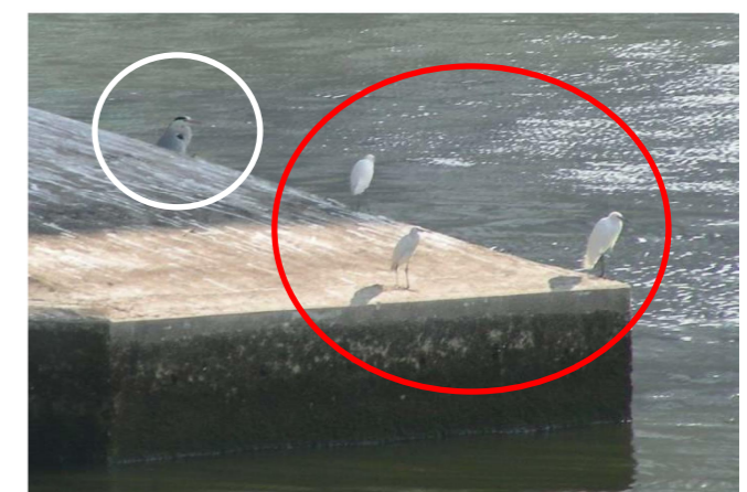
Plate 12 - Grey Heron ( Ardea cinerea ) in white circle Little Egret ( Egretta garzetta ) in red circle