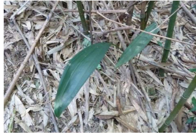
Plate 2 - Ania hongkongensis