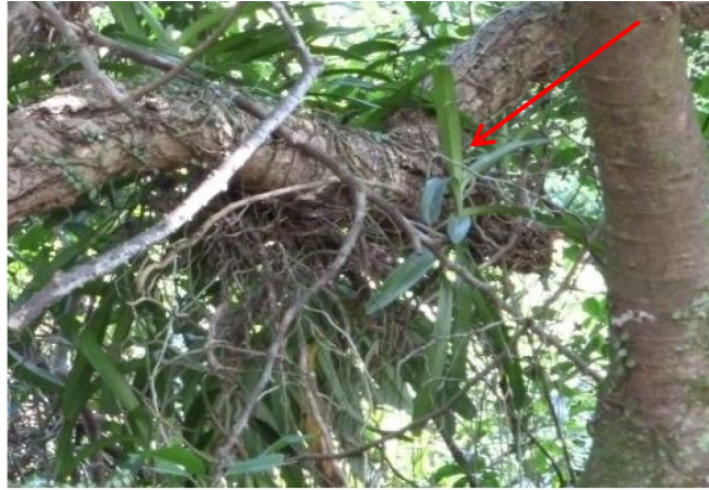
Plate 1 - Acampe rigida