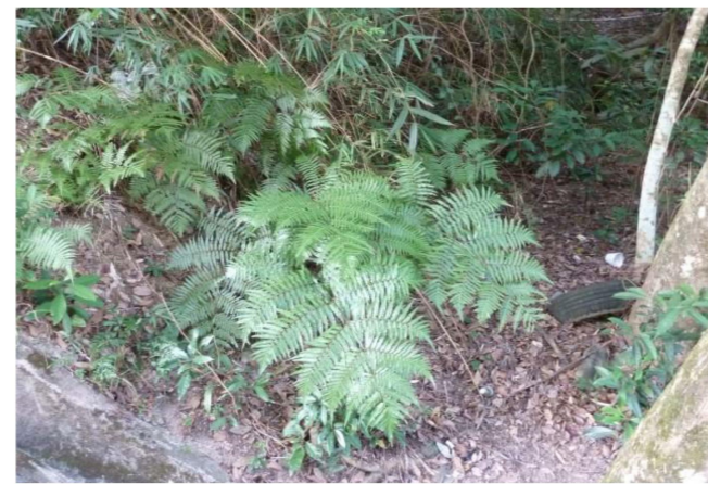
Plate 6 - Cibotium barometz