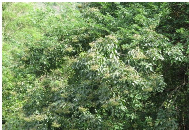
Plate 5 - Canthium dicoccum