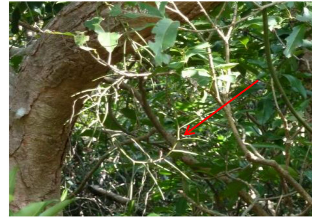
Plate 7 - Cleistoma simondii var. guangdongense