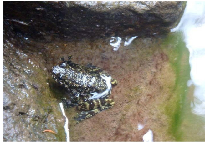
Plate 15 - Hong Kong Cascade Frog ( Amolops hongkongensis )