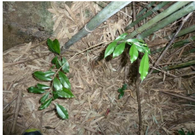
Plate 3 - Aquilaria sinensis