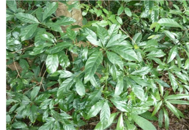
Plate 9 - Pavetta hongkongensis