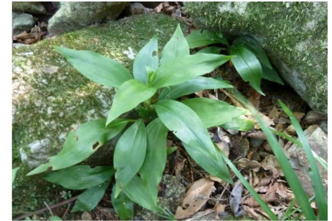
Plate 8 - Goodyera procera