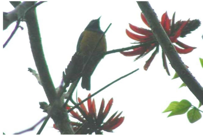
Plate 13 - Orange-bellied Leafbird ( Chloropsis hardwickii )