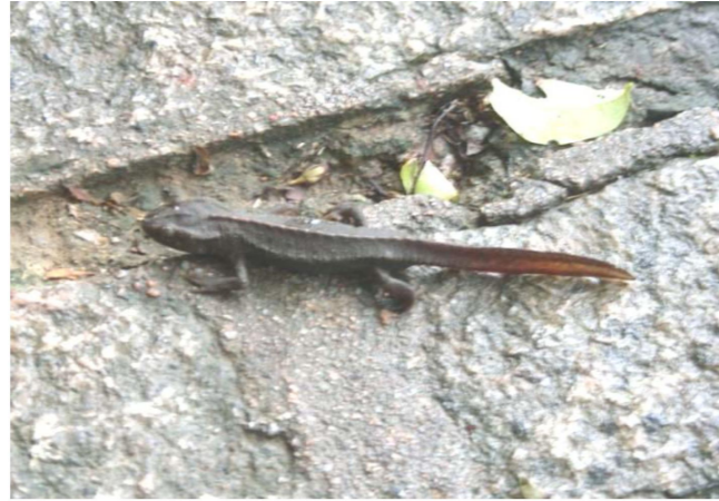
Plate 14 - Hong Kong Newt ( Paramesotriton hongkongensis )