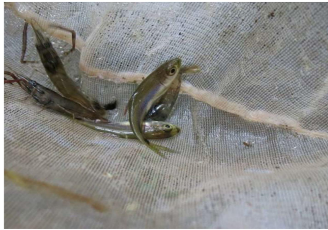
Plate 16 - Parazacco spilurus