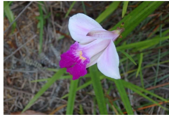
Plate 4 - Arundina graminiflora