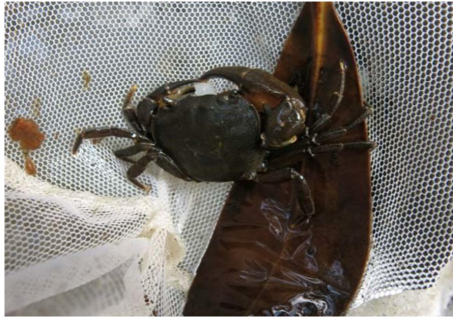
Plate 18 - Cryptopotamon anacoluthon