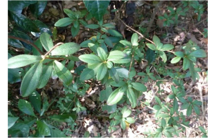
Plate 10 - Rhododendron simsii