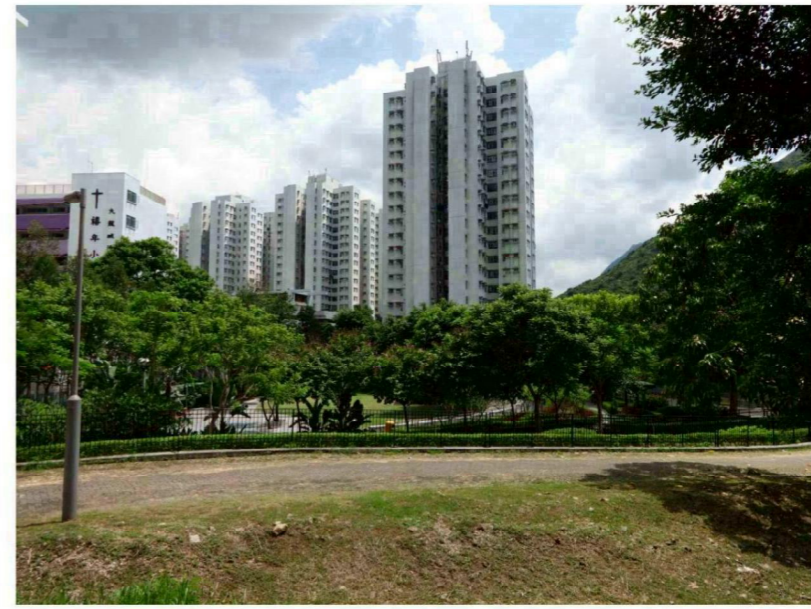
LR-09 LANDSCAPE AREAS WITHIN CHEVALIER GARDEN