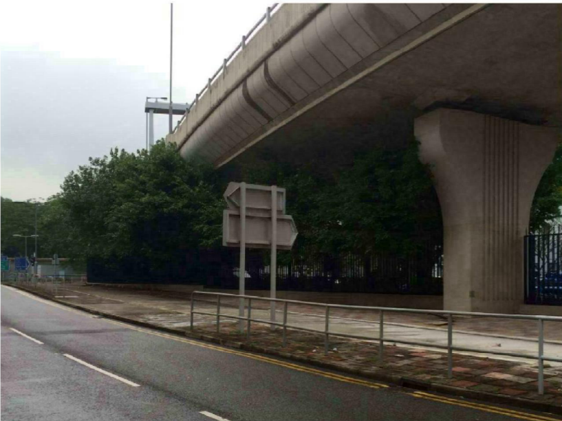
LR-16 LANDSCAPE AREAS IN MARINE POLICE HEADQUARTERS AND WSD SALT WATER PUMPING STATION