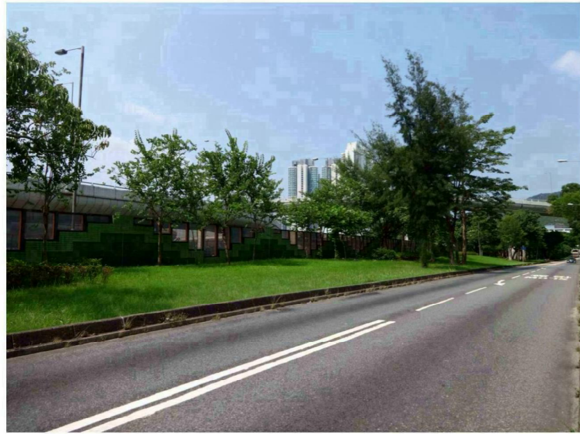
LR-07 ROADSIDE PLANTING AREAS ALONG MA ON SHAN ROAD