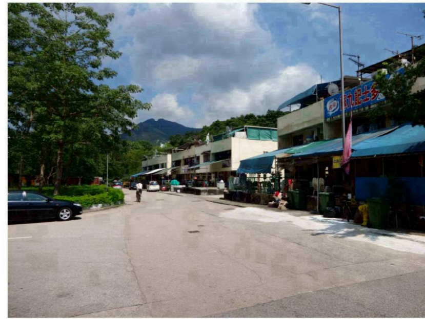
LR-12 LANDSCAPE AREAS AT AH KUNG KOK FISHERMEN VILLAGE