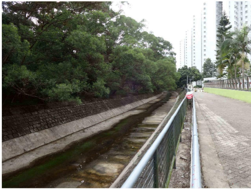
LR-13 STREAM RUNNING ALONG MUI TSZ LAM ROAD