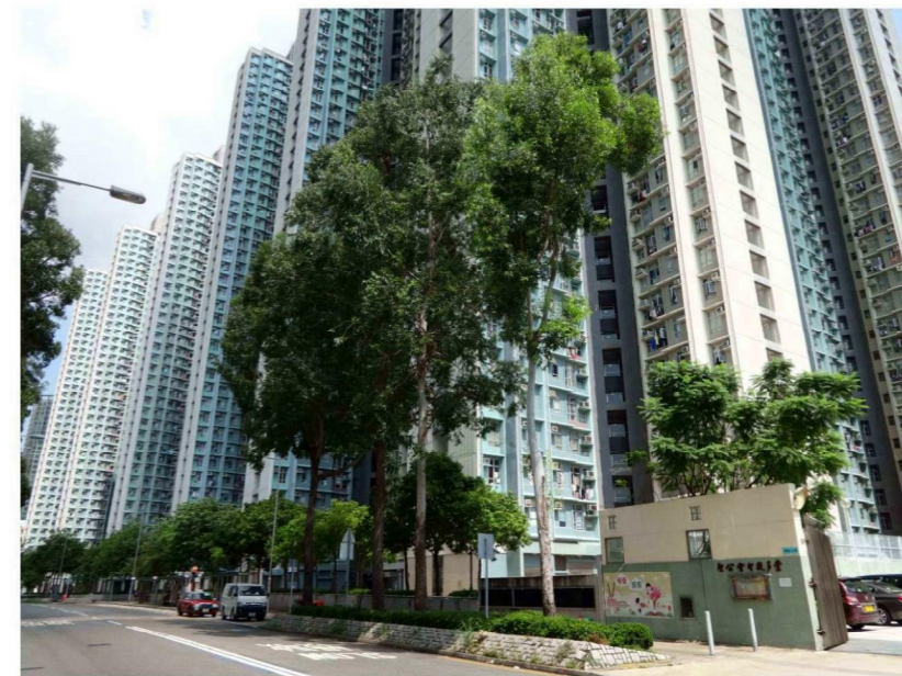
LR-06 LANDSCAPE AREAS WITHIN KAM TAI COURT