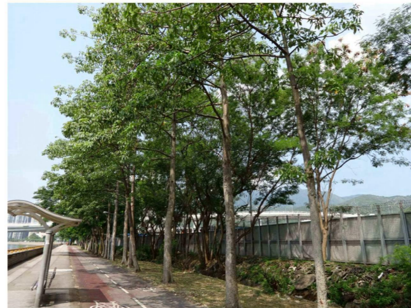
LR-05 SHING MUN RIVER PROMENADE