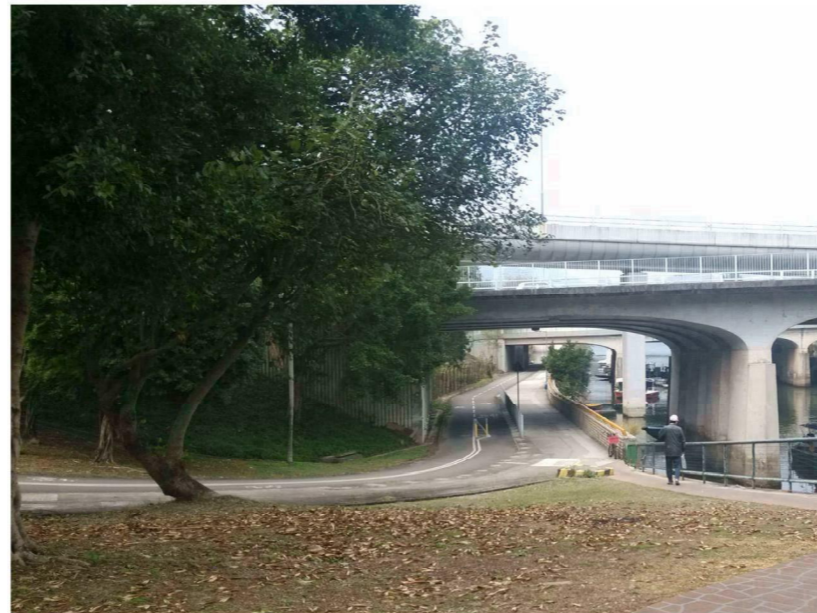
LR-17 CYCLE TRACK CONNECTING THE WATERFRONT PROMENADE AND A KUNG KOK STREET