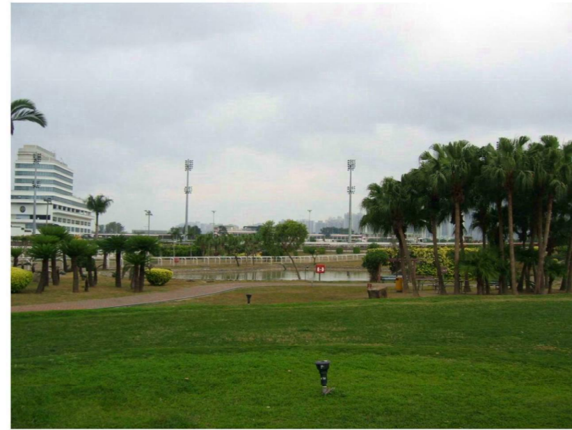
LR-03 LANDSCAPE AREAS IN SHA TIN RACECOURSE