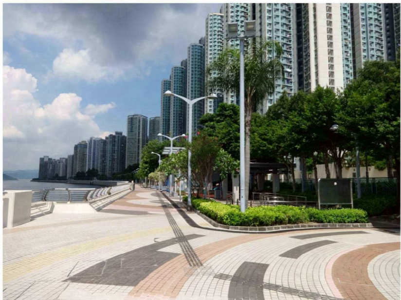
LR-04 MA ON SHAN PROMENADE