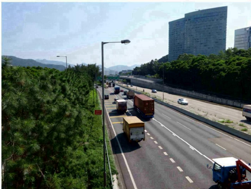
LR-10 ROADSIDE PLANTING AREAS ALONG TOLO HIGHWAYS