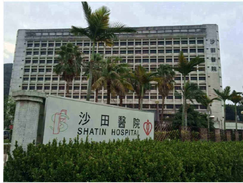
LR-14 LANDSCAPE AREAS IN SHATIN HOSPITAL