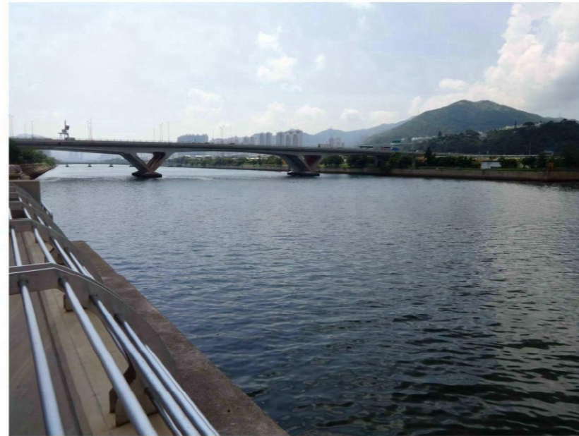
LR-02 WATERBODIES IN SHING MUN RIVER AND SHA TIN HOI