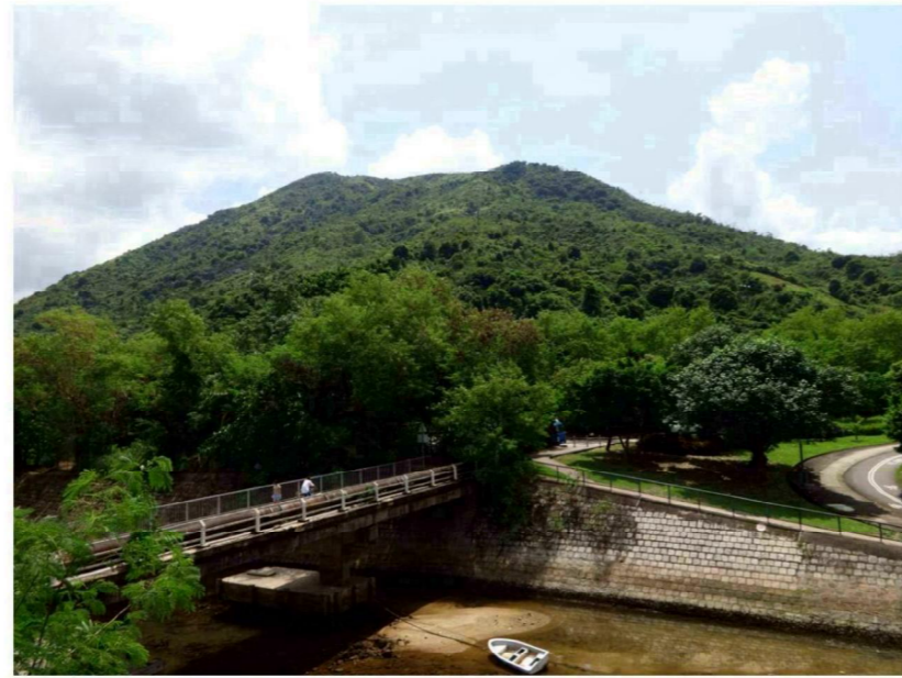
LR-08 WOODLAND ON SLOPES OF MA ON SHAN