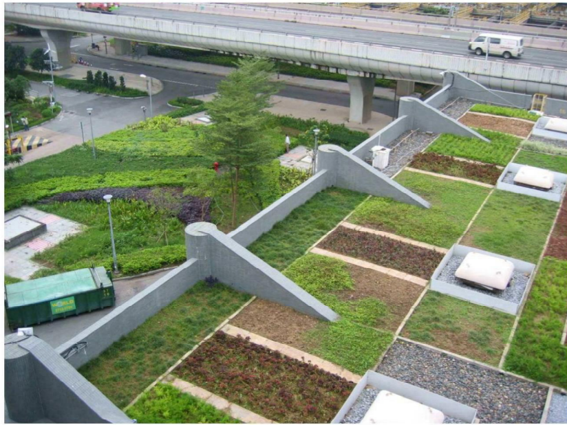
LR-01 AMENITY PLANTING IN THE EXISTING STSTW