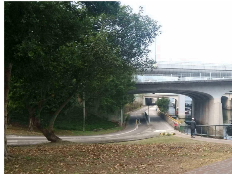
LR-17 CYCLE TRACK CONNECTING THE WATERFRONT PROMENADE AND A KUNG KOK STREET