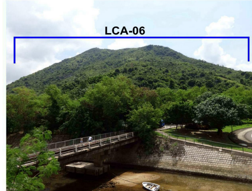
LCA-06 NUI PO SHAN UPLAND AND HILLSIDE LCA (VIEWPOINT V6)