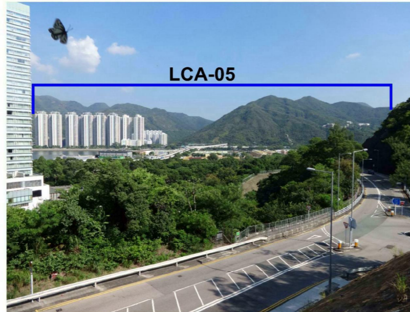
LCA-05 A KUNG KOK AND TAI SHUI HANG MISCELLANEOUS URBAN FRINGE LCA (VIEWPOINT V5)