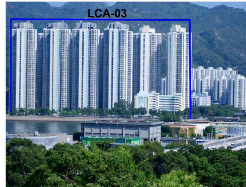
LCA-03 MA ON SHAN WATERFRONT RESIDENTIAL LCA (VIEWPOINT V3)