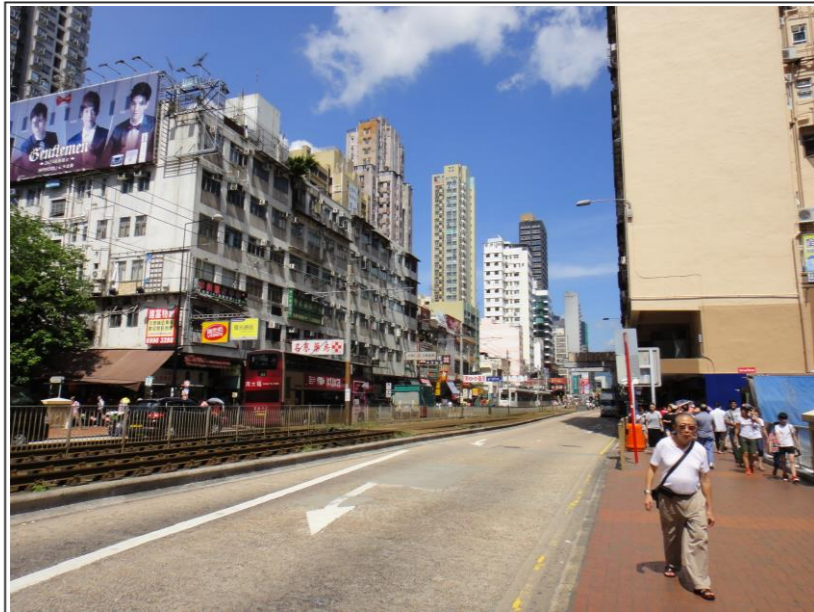
LCA1 - Yuen Long Traditional Urban Landscape Character Area