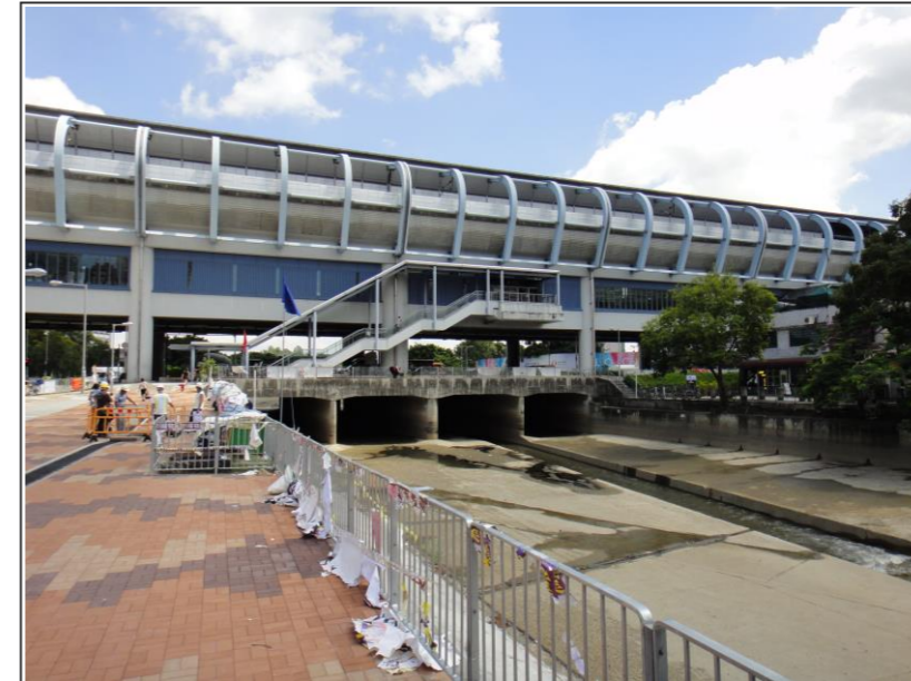
LCA3 - Yuen Long Infrastructure Network West Rail – Long Ping Station