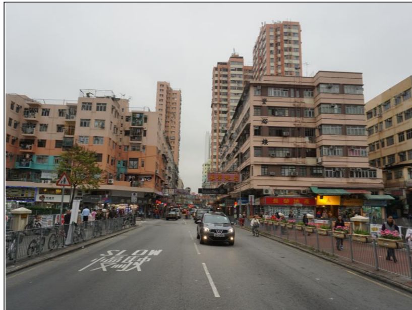
LCA7 – Major Transportation Corridor Landscape