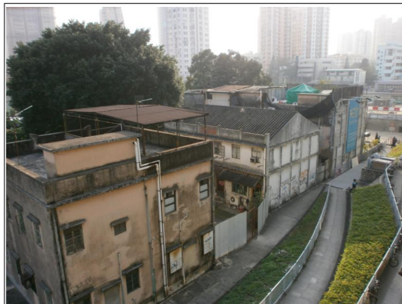
LCA5 – Tai Kiu Tsuen Village Landscape