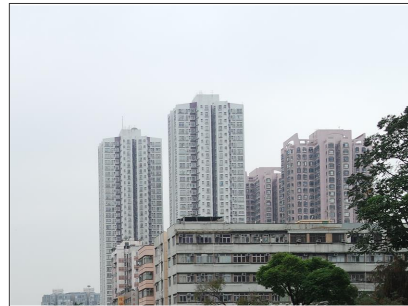
LCA6 – Residential Urban Landscape