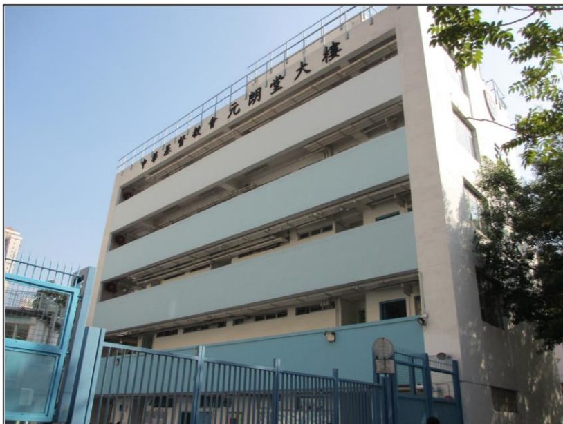
LCA4 - Yuen Long Miscellaneous Urban Fringe Landscape