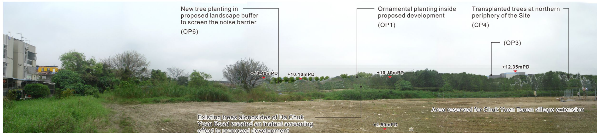
Year 10 of Operation Phase with landscape mitigation measures fully established