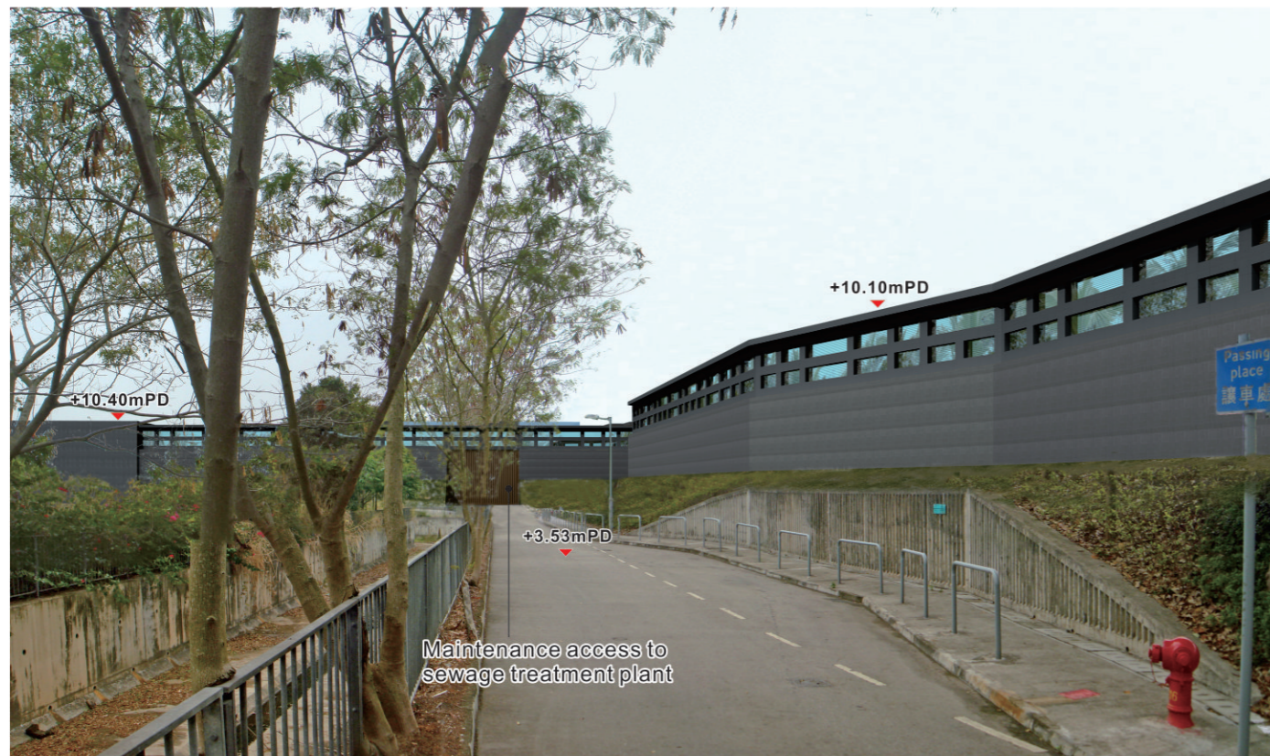
Day 1 of Operation Phase without landscape mitigation measures