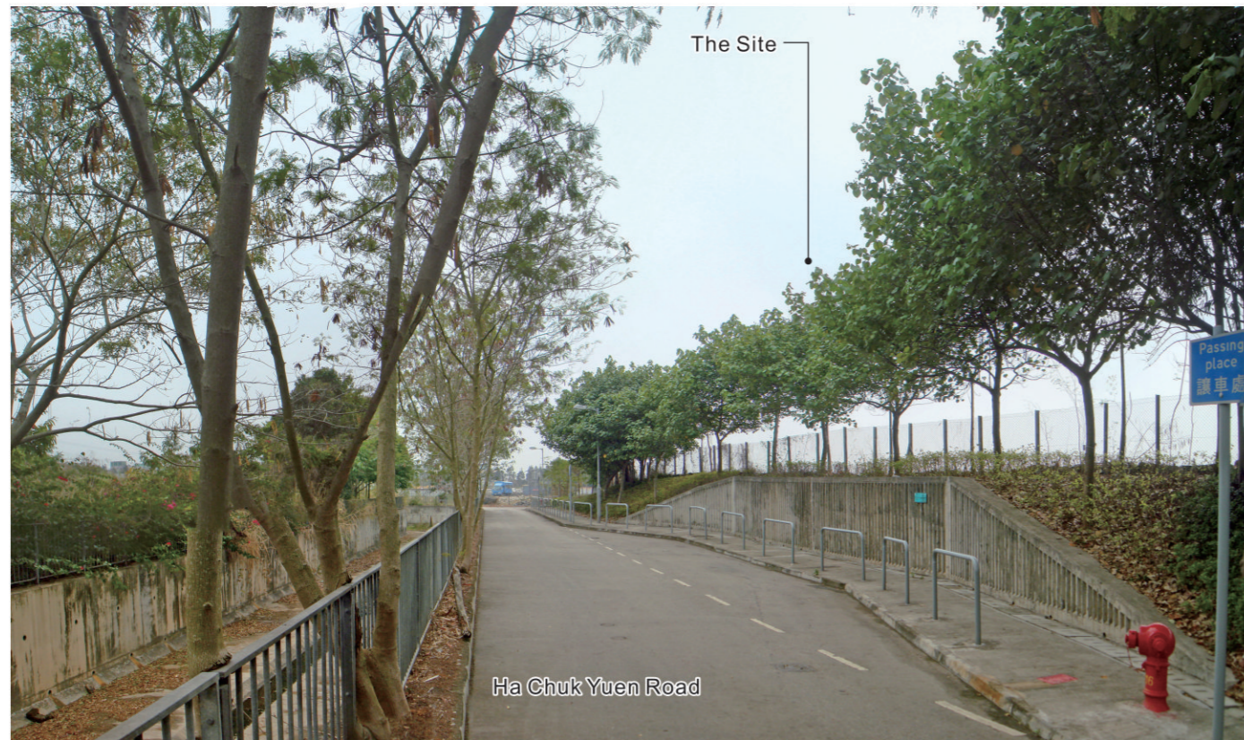
Existing Condition Looking southwest towards the development site at street level from Ha Chuk Yuen Road representing views from transient VSRs along Ha Chuk Yuen Road (VSR5)