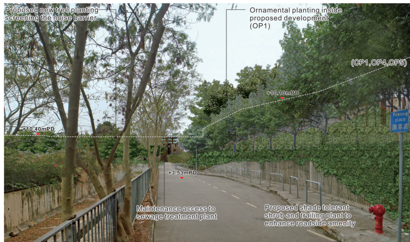
Year 10 of Operation Phase with landscape mitigation measures fully established