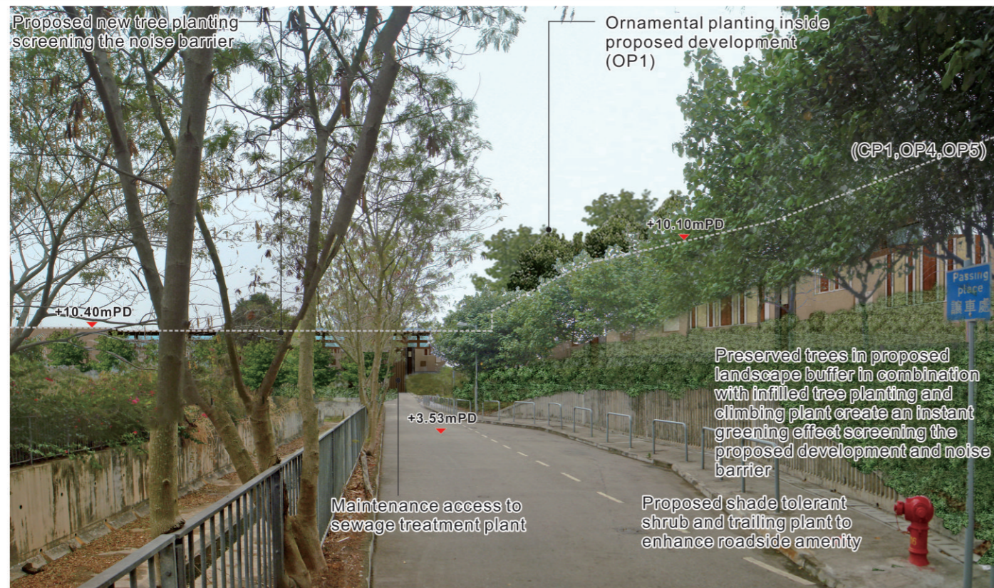
Day 1 of Operation Phase with landscape mitigation measures