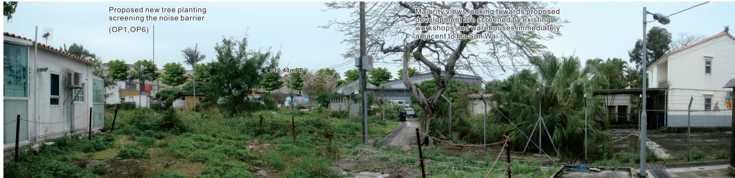
Day 1 of Operation Phase with landscape mitigation measures