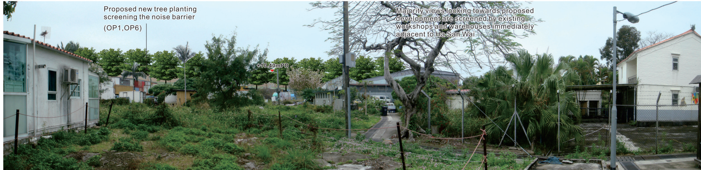
Year 10 of Operation Phase with landscape mitigation measures fully established