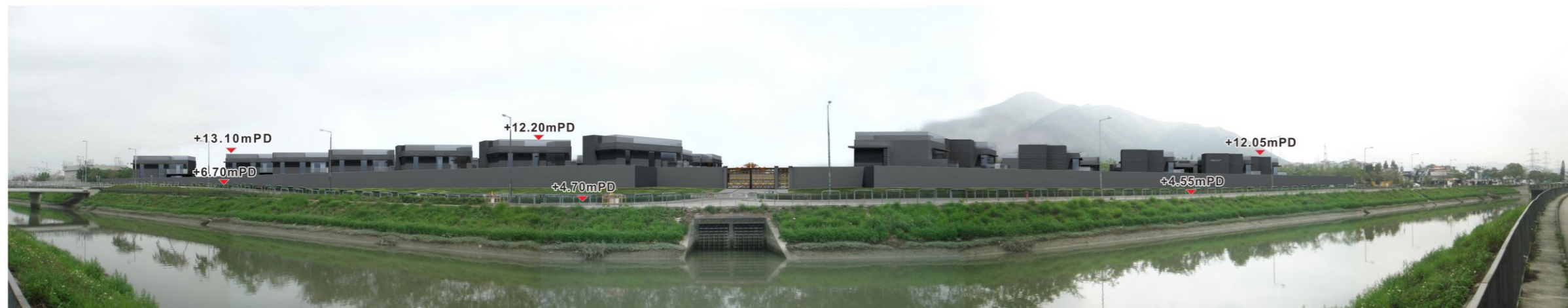
Day 1 of Operation Phase without landscape mitigation measures