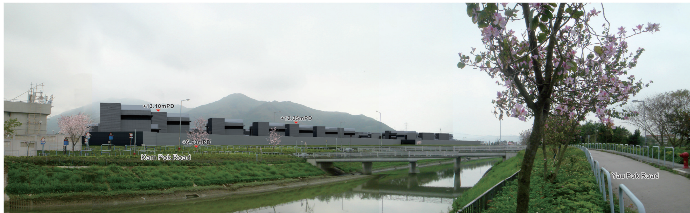
Day 1 of Operation Phase without landscape mitigation measures