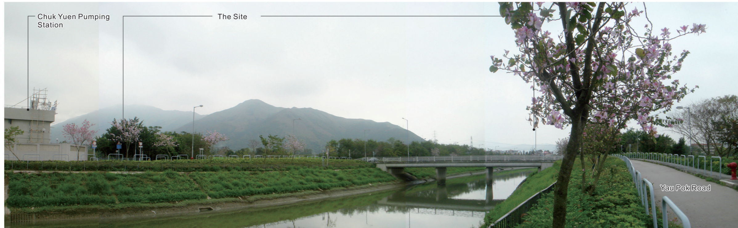
Existing Condition Looking southeast towards the development site from Yau Pok Road representing views from transient VSRs along Ngau Tam Mei Drainage Channel (VSR11), Future Residents and Recreational Users of Planned Recreation Zone to the east of Fairview Park (PVS12A&B) and Workers at Chuk Yuen Pumping Station and Storage Pond (VSR2), and permanent VSRs Residents of Planned Low-rise House Development at Fung Chuk Road North (PVSR1) and Fairview Park (VSR10).