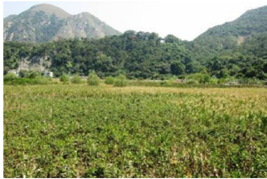
LR 2 - MARSH / REEDBED; LCA 7 - MANGROVE / MARSH / REEDBED LCA