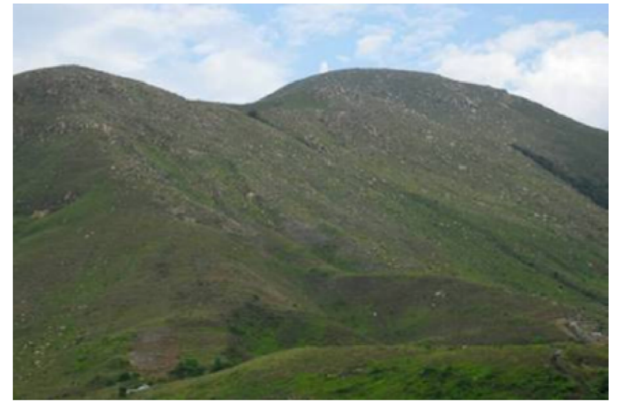
LR 6 - GRASSLAND