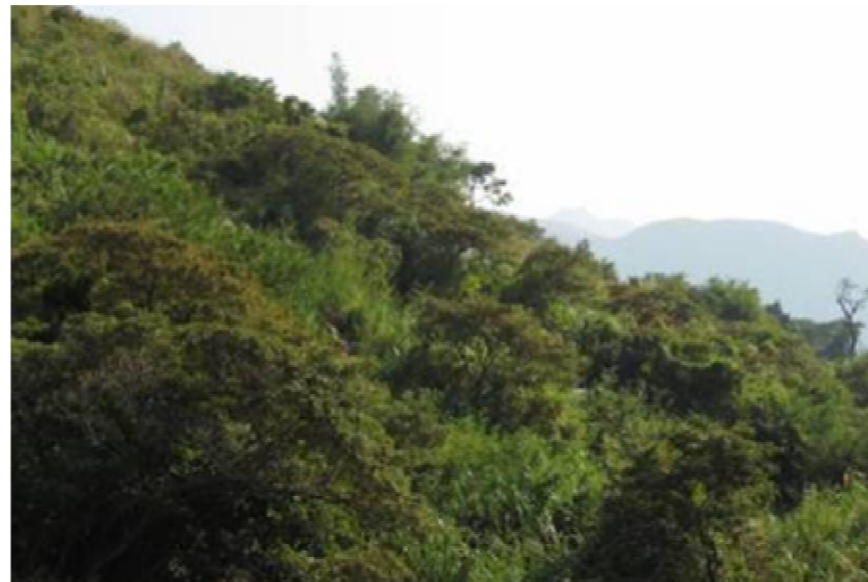
LR 5 - SHRUBLND