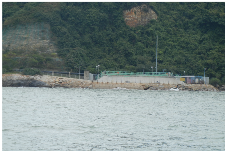
LR 8 - WATERBODY; LCA 6 - WATERBODY (MARINE) LCA