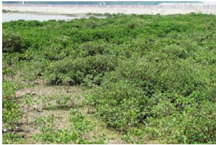
LR 1 - MANGROVE