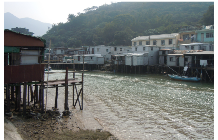
LR 11 - VILLAGE; LCA 5 - VILLAGE LCA