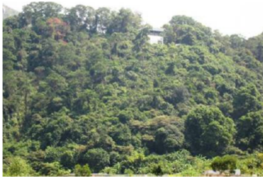
LR 4 - WOODLAND; LCA 4 - WOODLAND AND HILLSIDE LCA