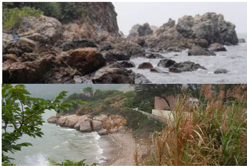
LR 7 - COASTAL AREA; LCA 2 - COASTAL SLOPE WITH VEGETATION LCA