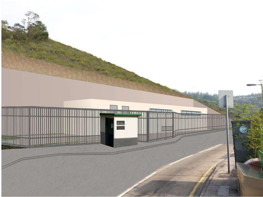
DAY 1 WITHOUT MITIGATION MEASURES