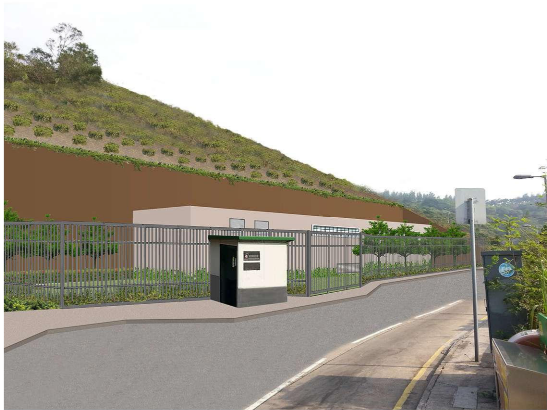
DAY 1 WITH MITIGATION MEASURES