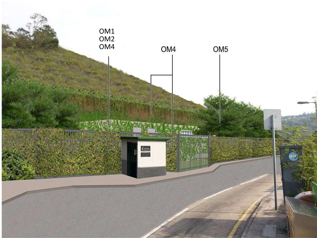
YEAR 10 WITH MITIGATION MEASURES