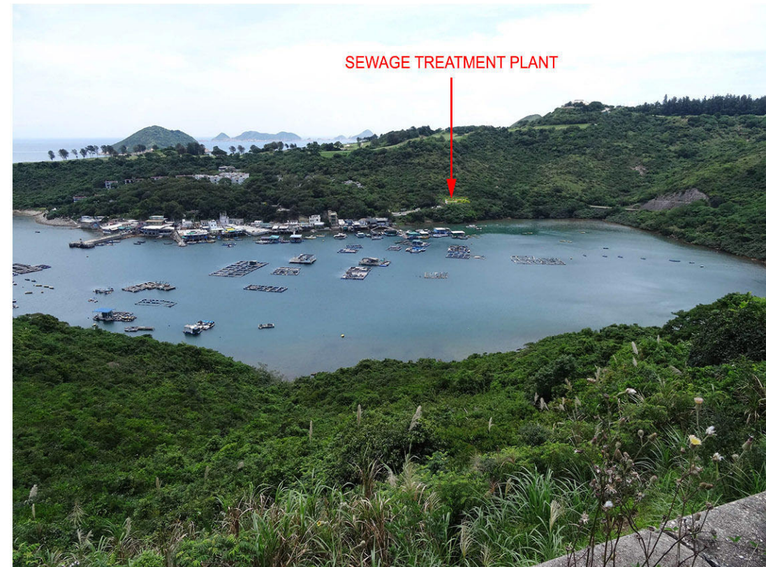
YEAR 10 WITH MITIGATION MEASURES