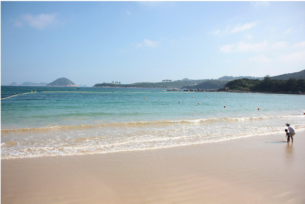
DAY 1 AND YEAR 10 WITH MITIGATION MEASURES