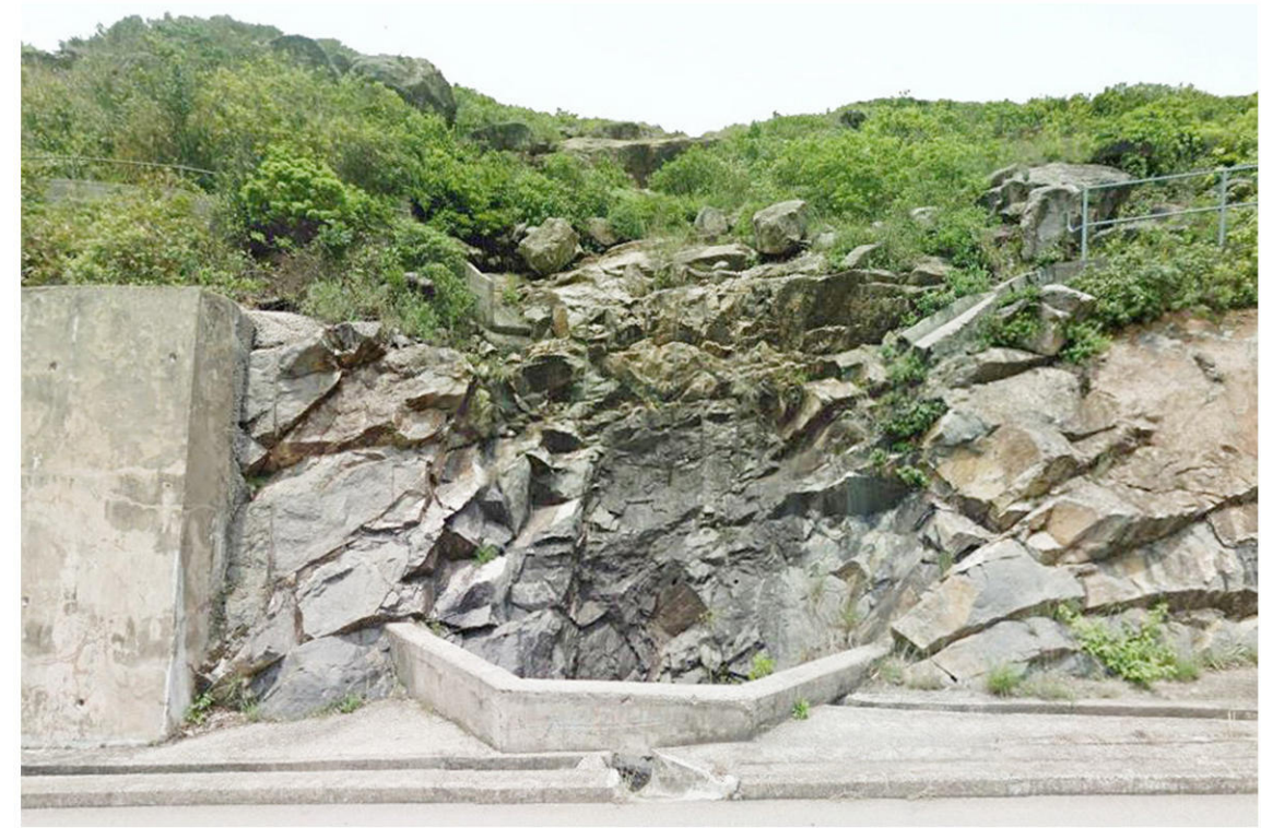
LR2 - STREAMS