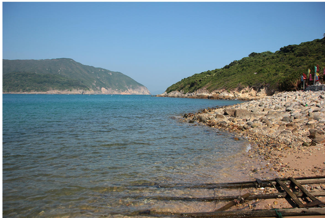
LR3 - NATURAL ROCKY COASTLINE