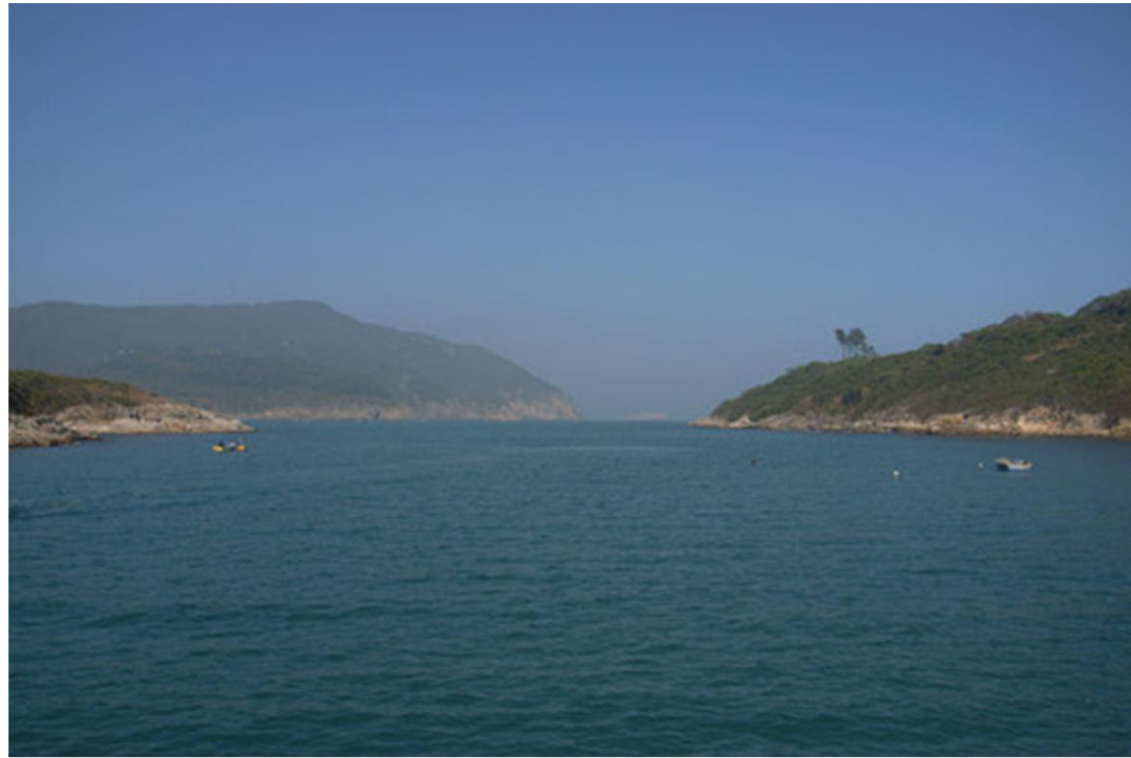
LR1 - COASTAL WATERS