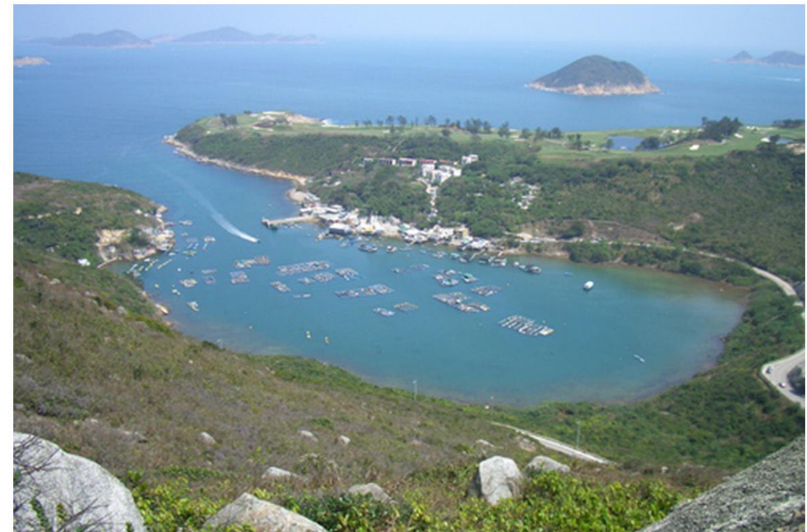
LR4 - NATURAL COASTAL UPLAND