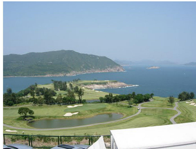
LCA5 - GOLF COURSE LANDSCAPE