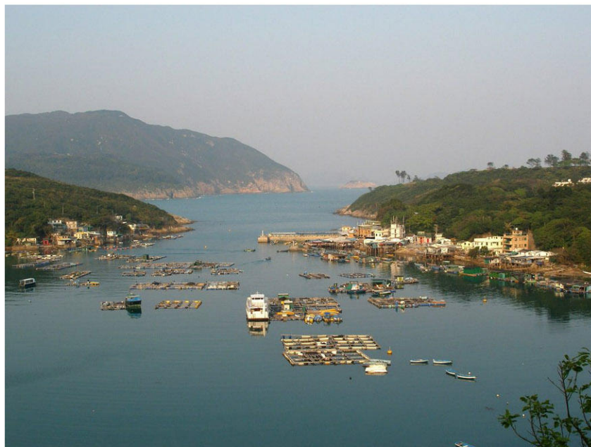
LCA4 - COASTAL VILLAGE LANDSCAPE