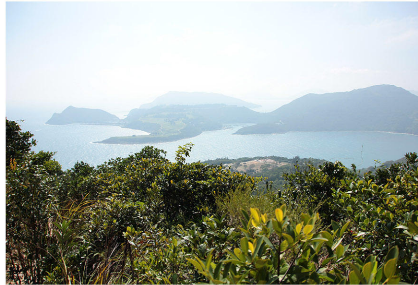
LCA2 - BAY LANDSCAPE