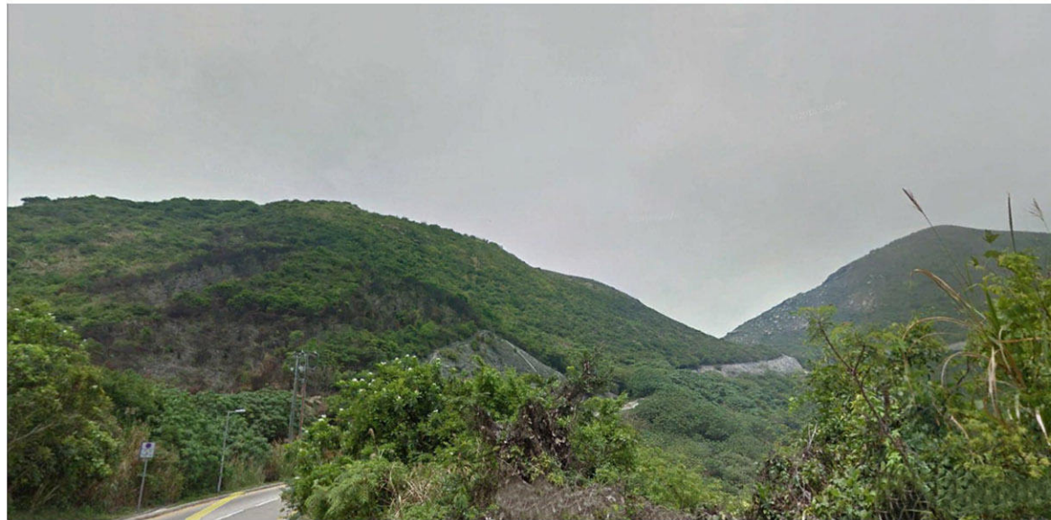
LCA1 - COASTAL UPLAND HILLSIDE