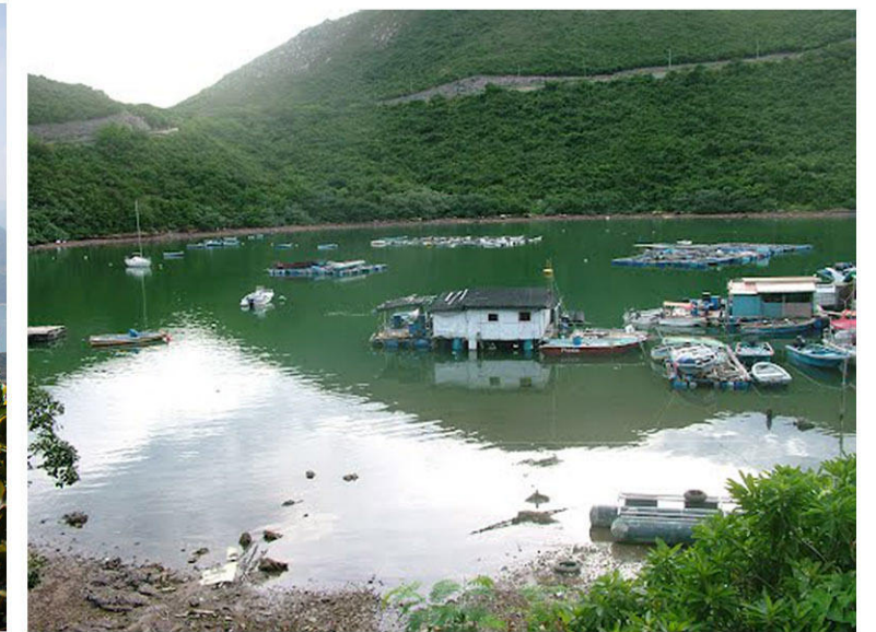
LCA3 - INTERTIDAL BAY LANDSCAPE