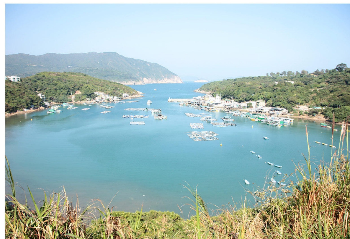
VC4: VIEW CORRIDOR FROM PO TOI O CHUEN ROAD LOOKING NORTH ACROSS PO TOI O