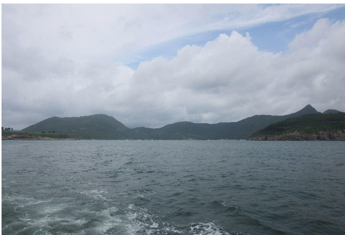
VC3: VIEW CORRIDOR FROM SEA LOOKING WEST ACROSS CLEAR WATER BAY