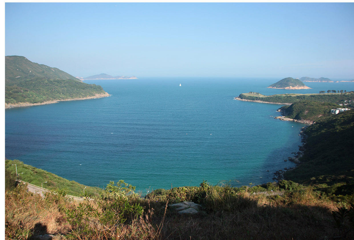
VC2: VIEW CORRIDOR FROM HA SHAN TUK LOOKING NORTH EAST ACROSS CLEAR WATER BAY