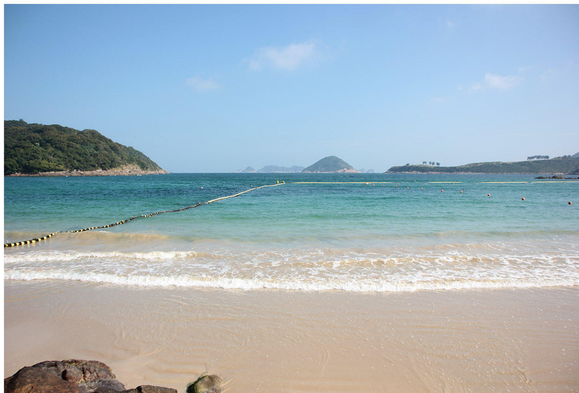
VC1: VIEW CORRIDOR FROM CLEAR WATER BAY SECOND BEACH LOOKING EAST ACROSS CLEAR WATER BAY